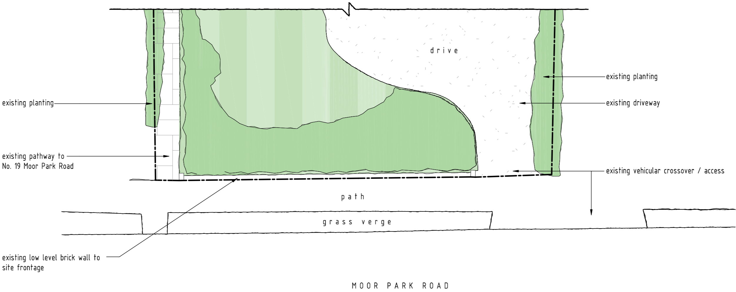
EXISTING CROSSOVER LAYOUT SCALE 1:100