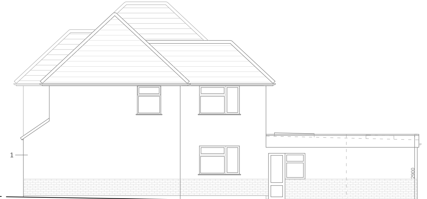
Proposed East Elevation SCALE 1:100