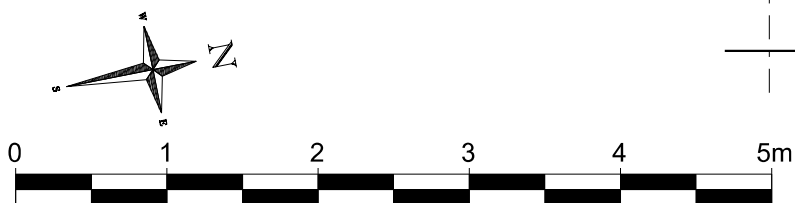
Scale 1:50 @ A3