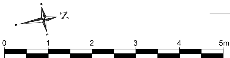
Scale 1:50 @ A3