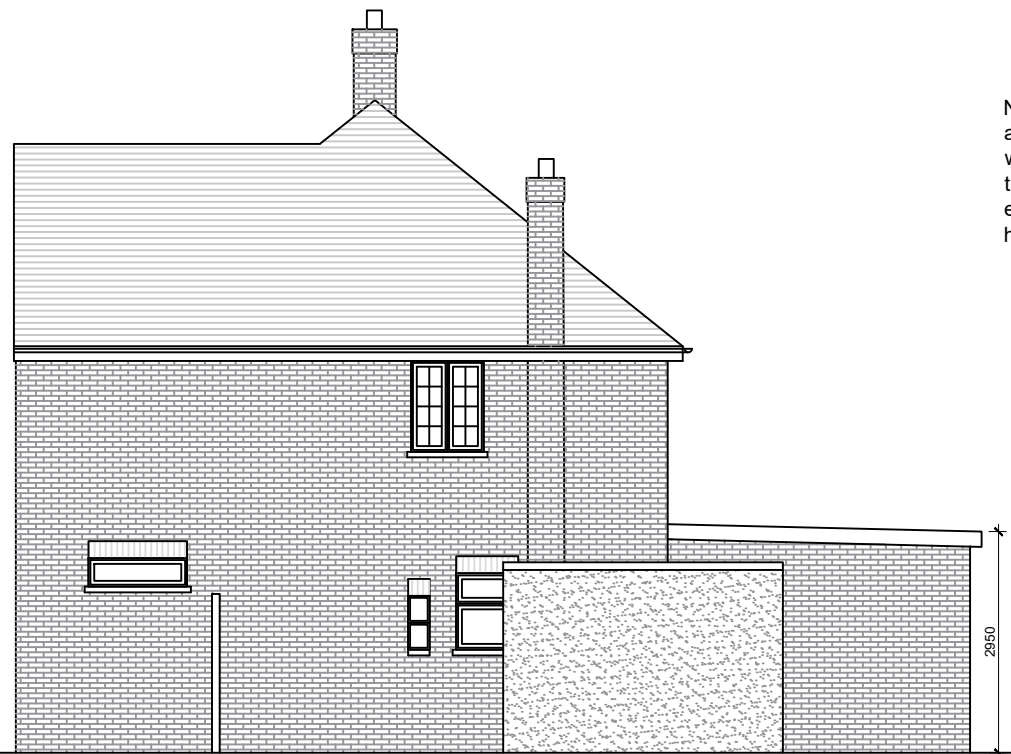
PROPOSED RIGHT ELEVATION

NOTE: all materials to be used in any exterior work shall be similar appearance to those used in the construction of the exteriors of the existing dwelling house.