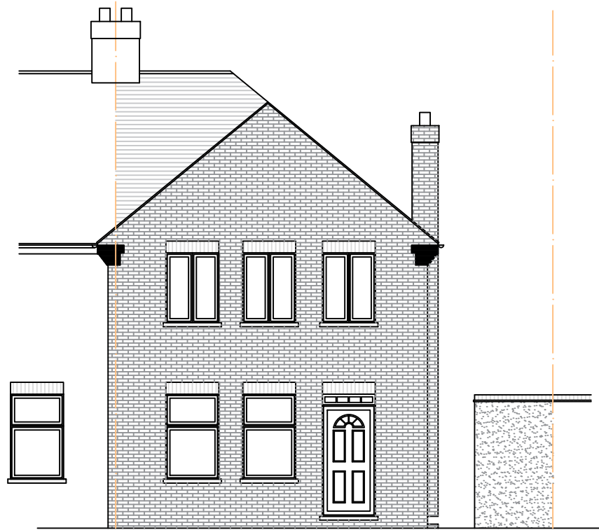
PROPOSED FRONT ELEVATION NO CHANGES