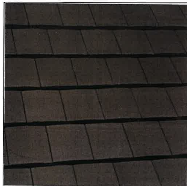
MARLEY ASHMORE INTERLOCKING DOUBLE PLAIN TILE SMOOTH GREY