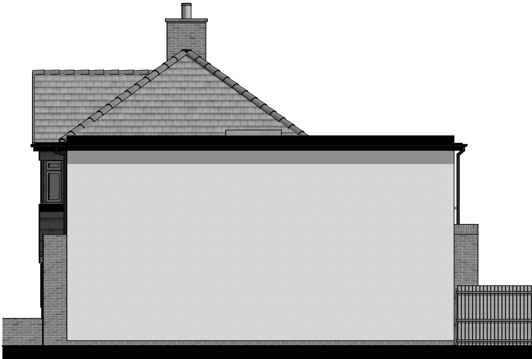
1:100 Proposed North West Elevation