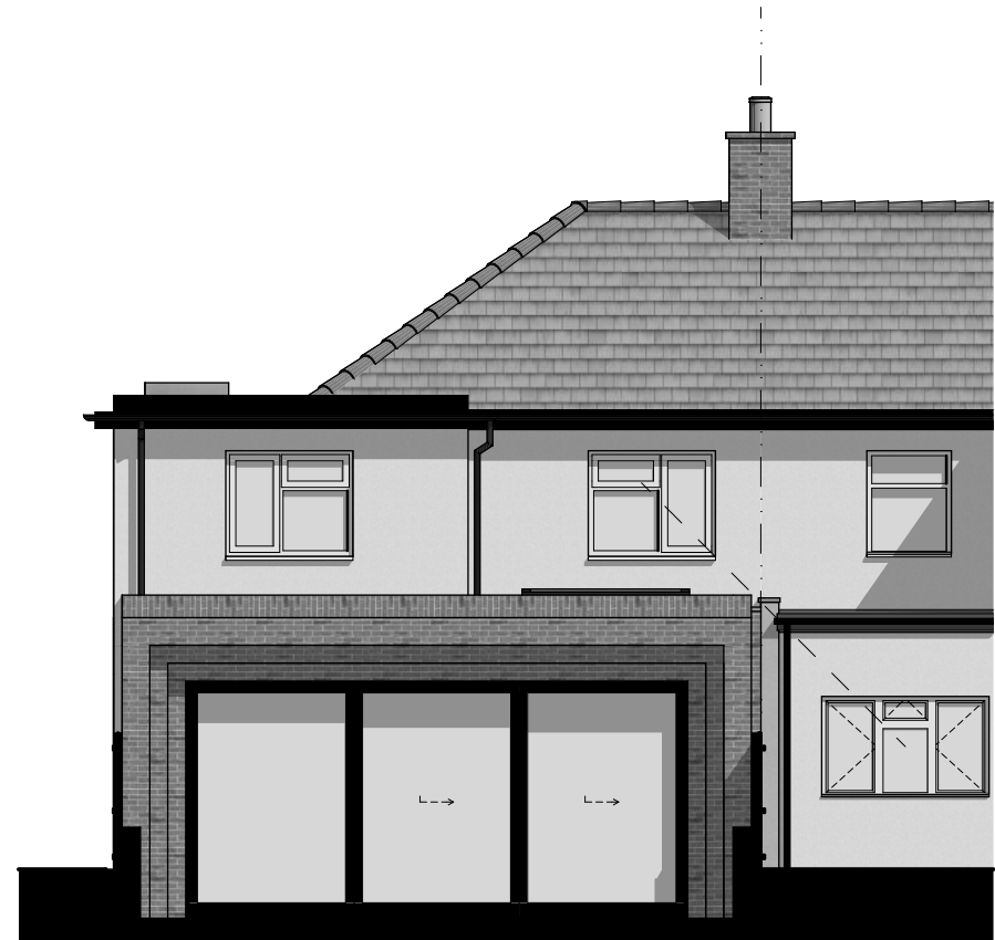
1:100 Proposed South West Elevation