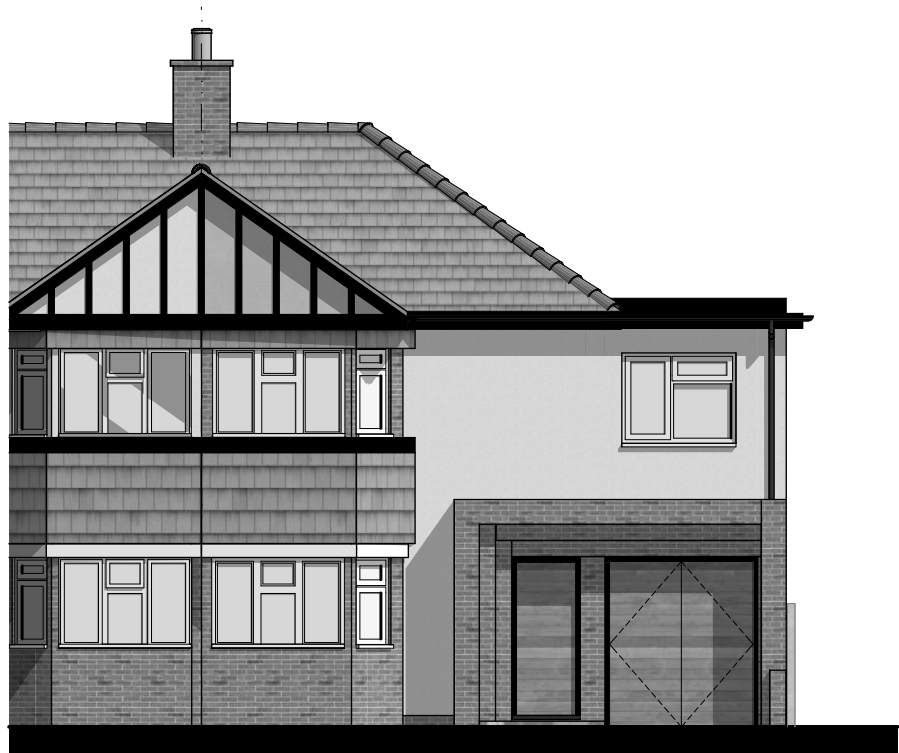
1:100 Proposed North East Elevation