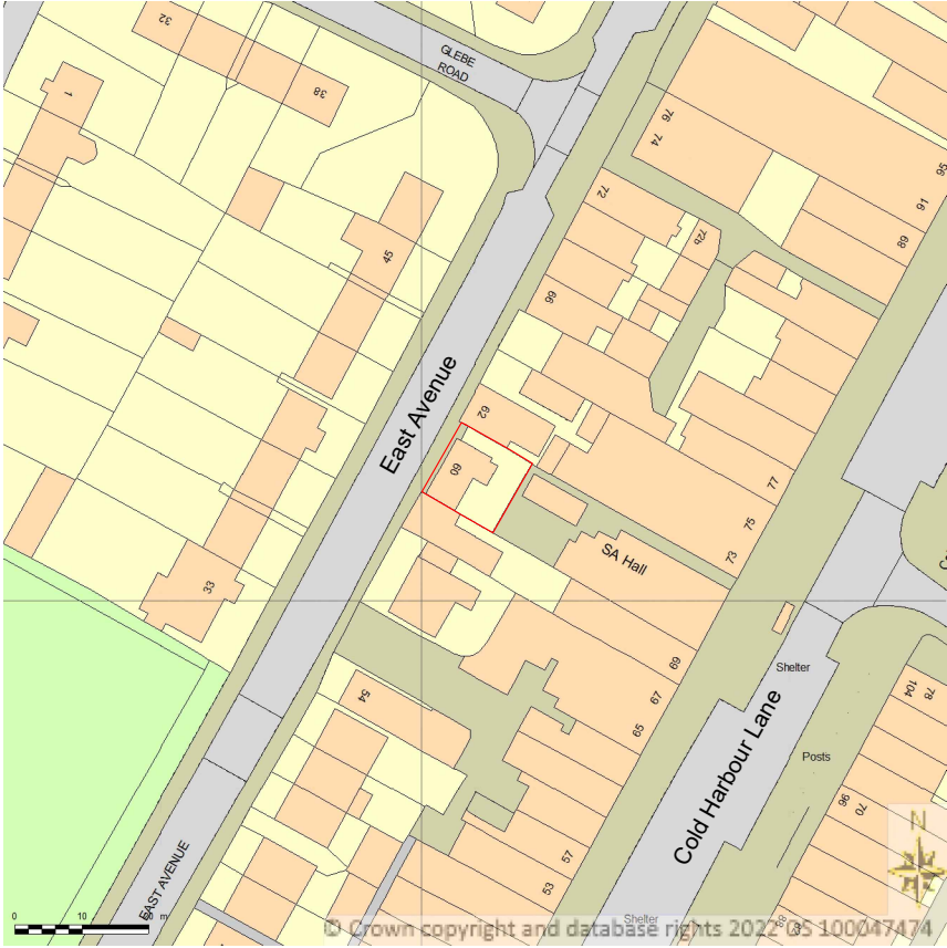
Location Plan@ 1:1250