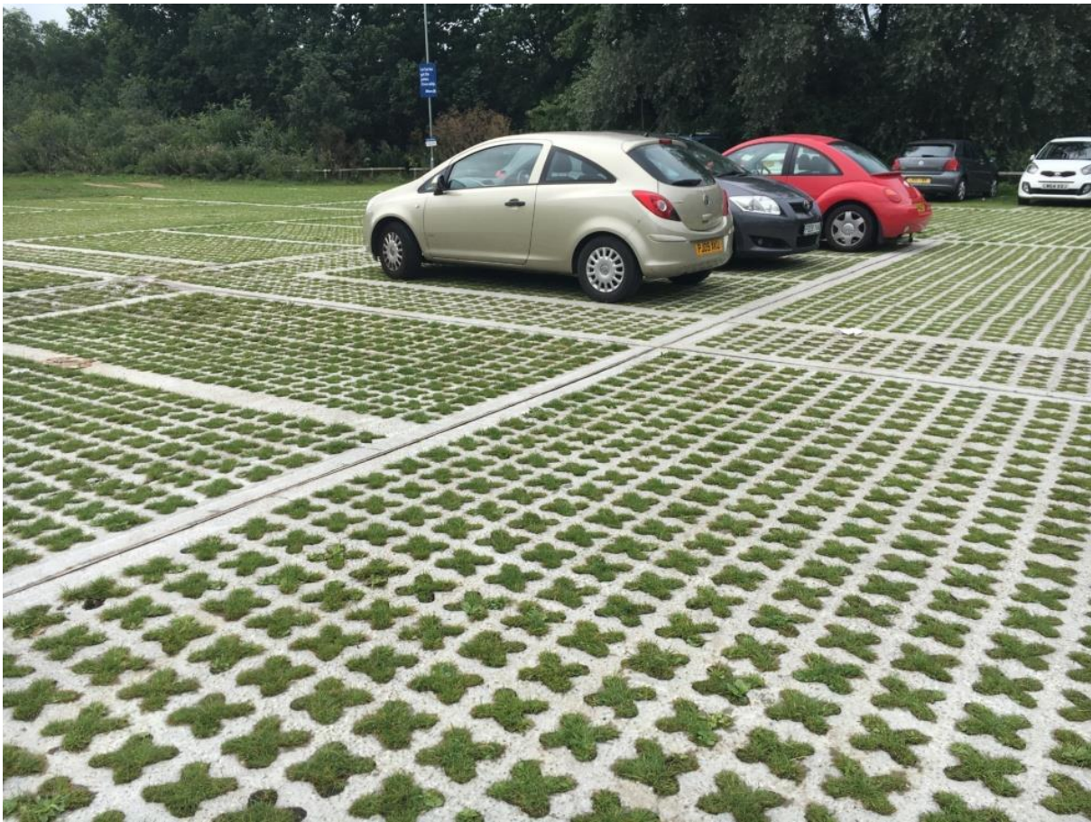
Figure 1: Grasscrete Car Park, a growing trend for greener & softer parking.