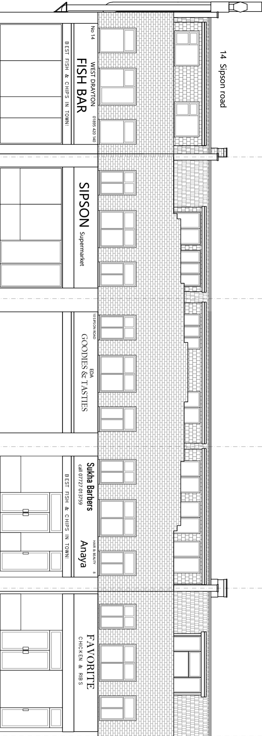
PROPOSED STREET VIEW 1 : 100 A3