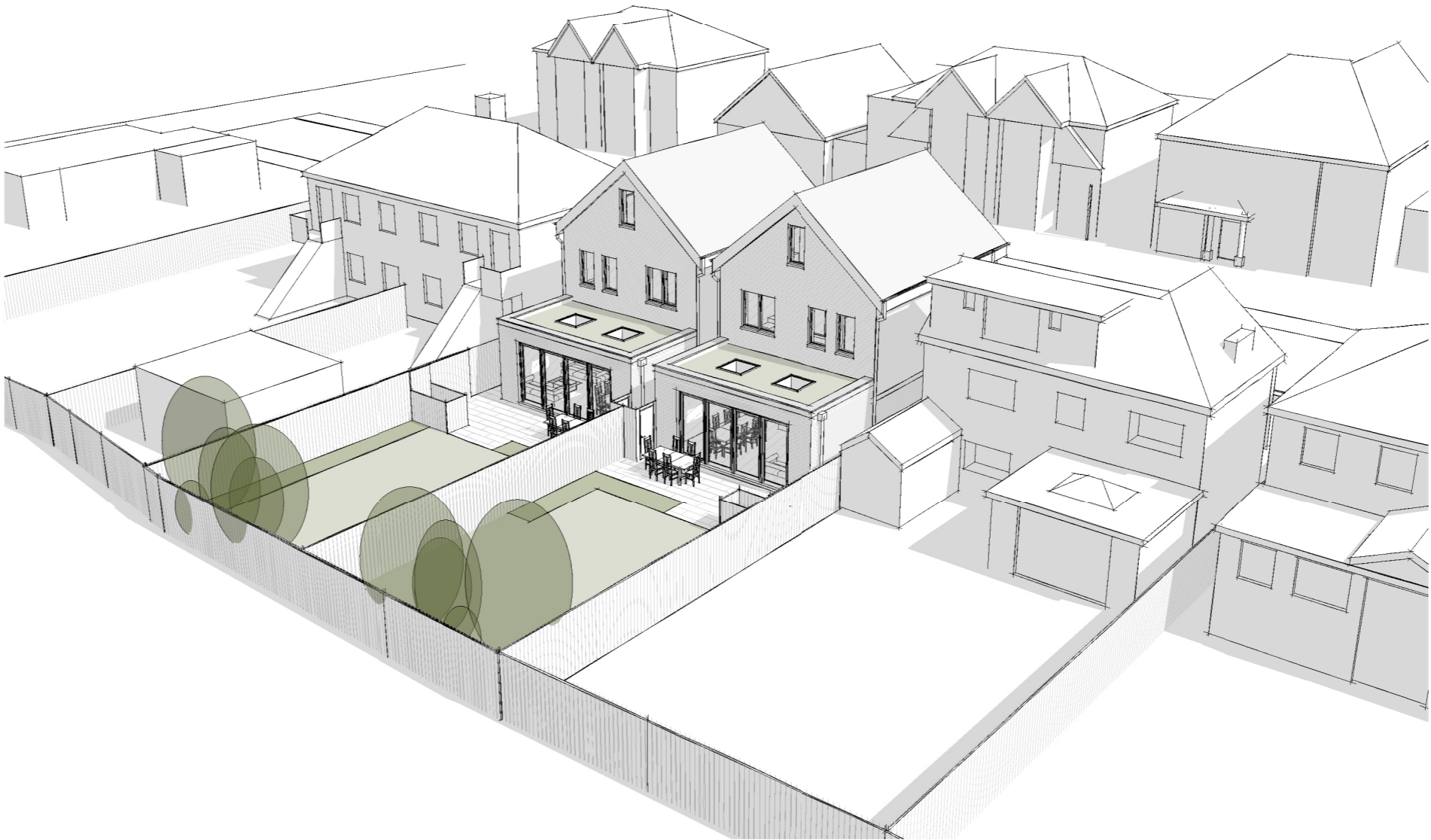
Proposed View 2