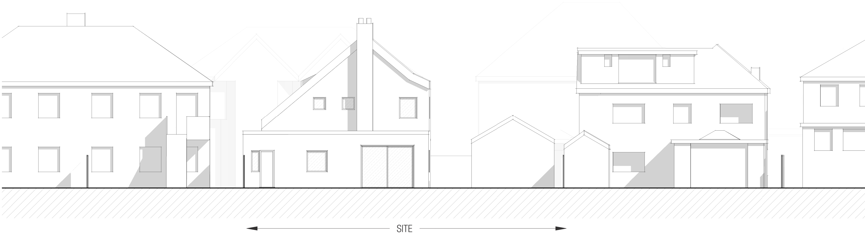
Existing South West Elevation 1 : 100