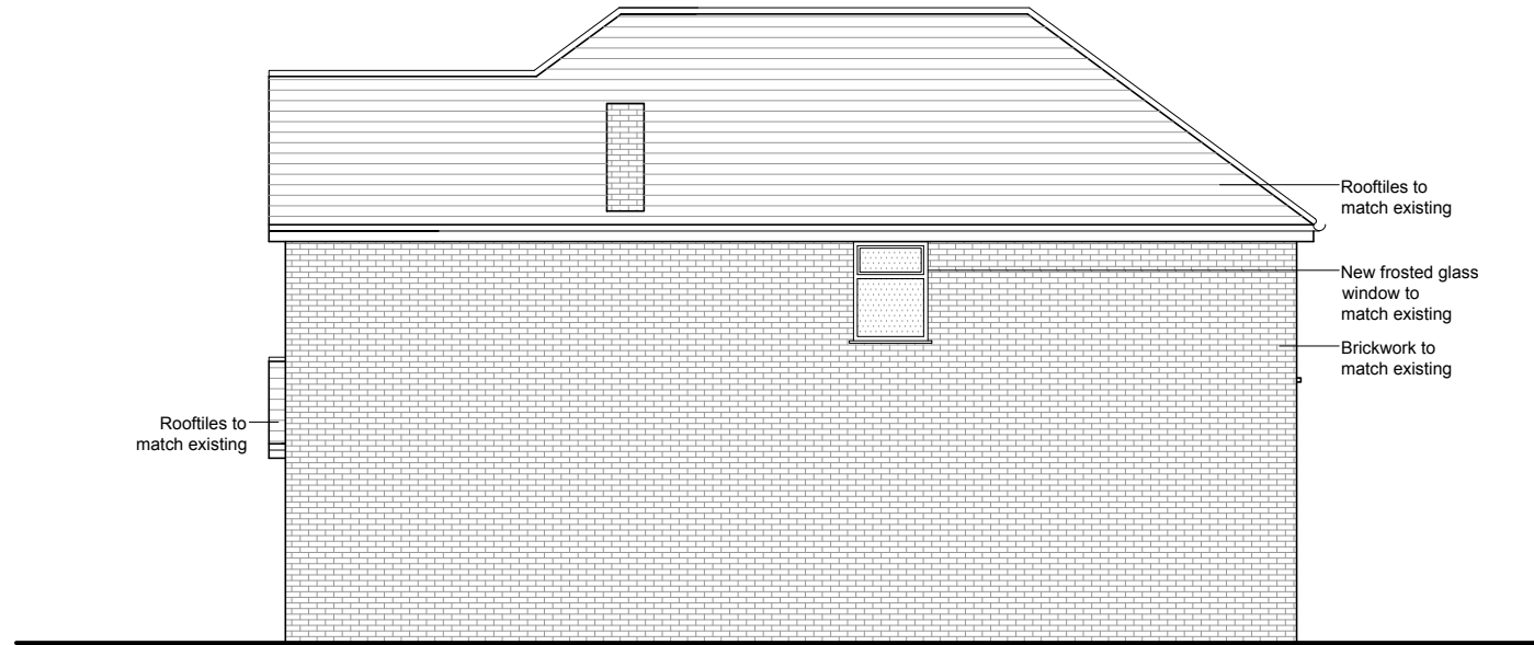
PROPOSED SIDE (RHS) ELEVATION