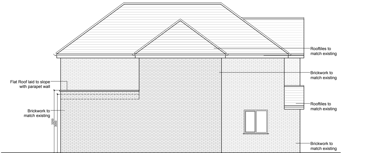
PROPOSED SIDE (LHS) ELEVATION