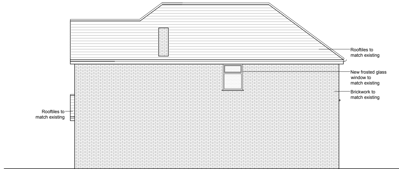
PROPOSED SIDE (RHS) ELEVATION