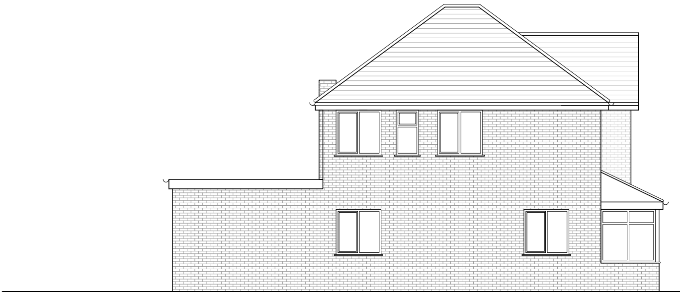
EXISTING SIDE (LHS) ELEVATION