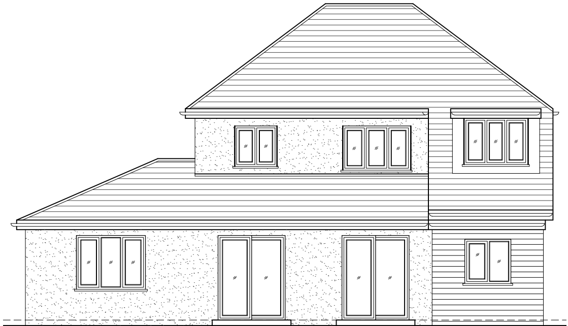
03 - REAR ELEVATION