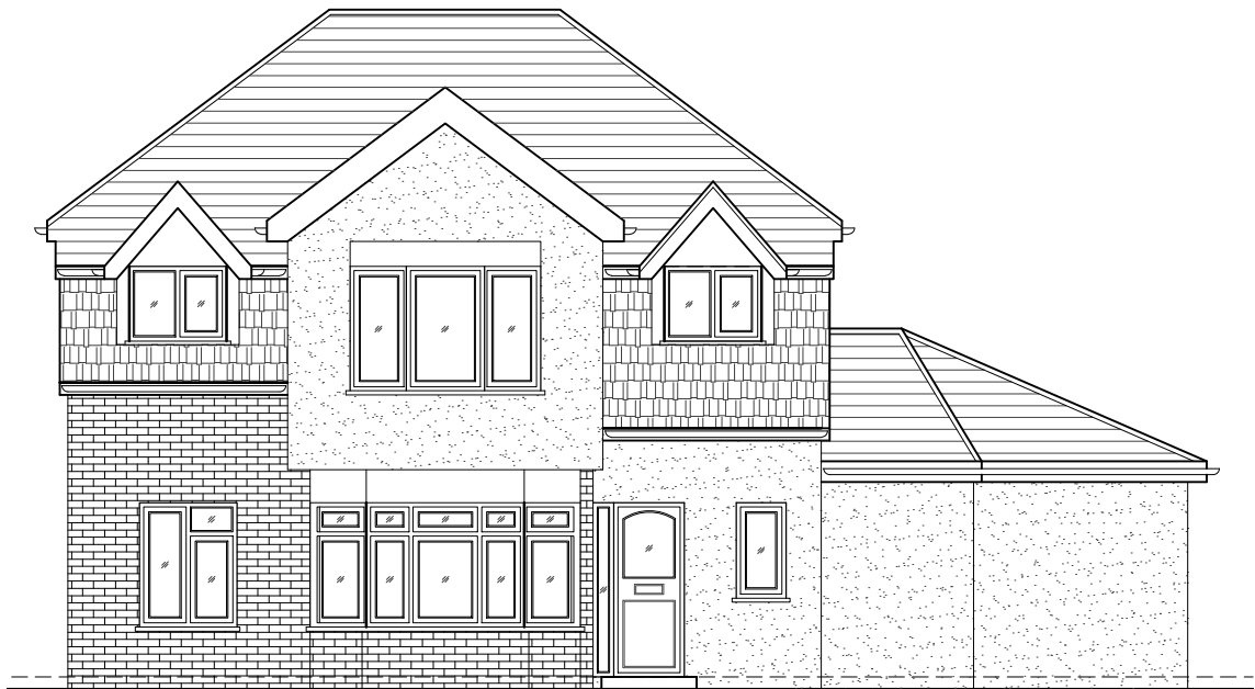
02 - FRONT ELEVATION