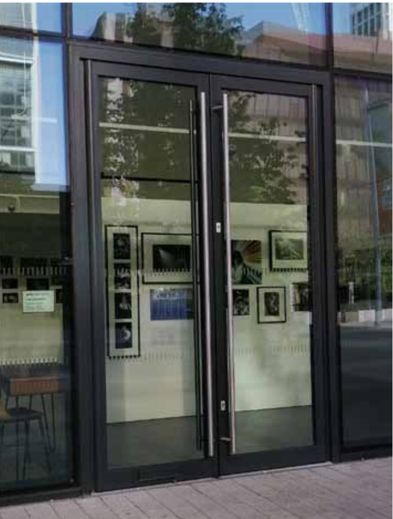
Precedent image for CW-01, CW-02, CW-03 - VE;FAC