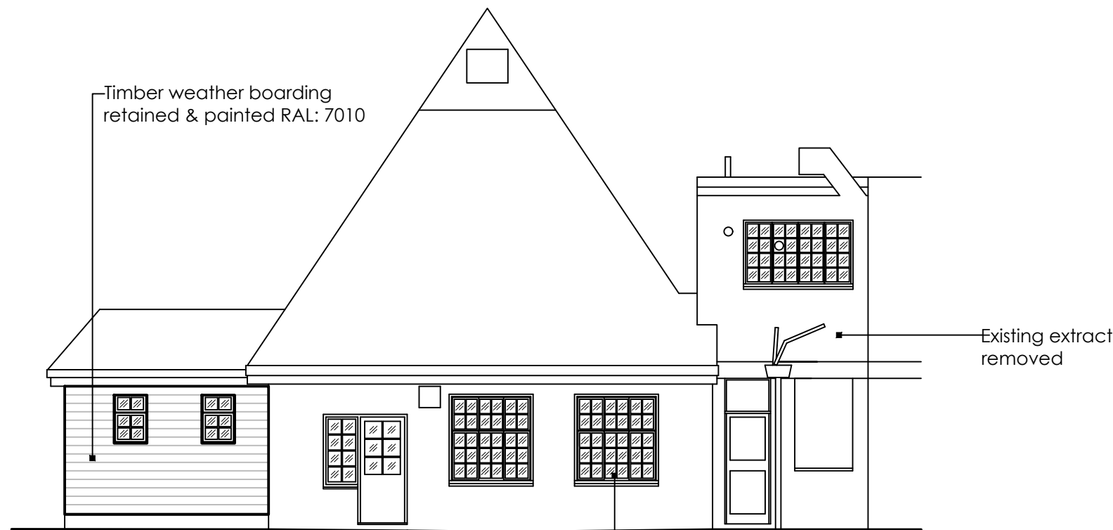
ELEVATION D Scale 1:100