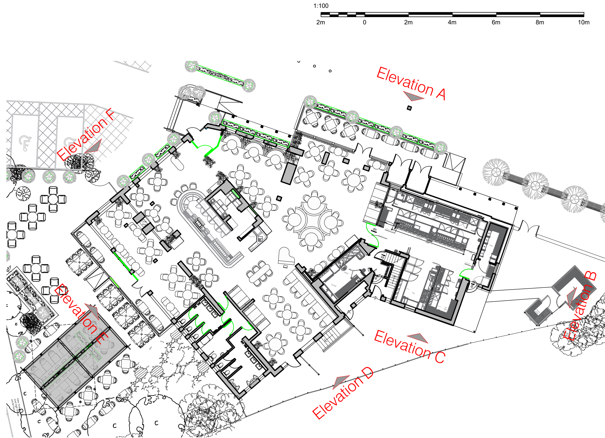
LOCATION PLAN Scale 1:200