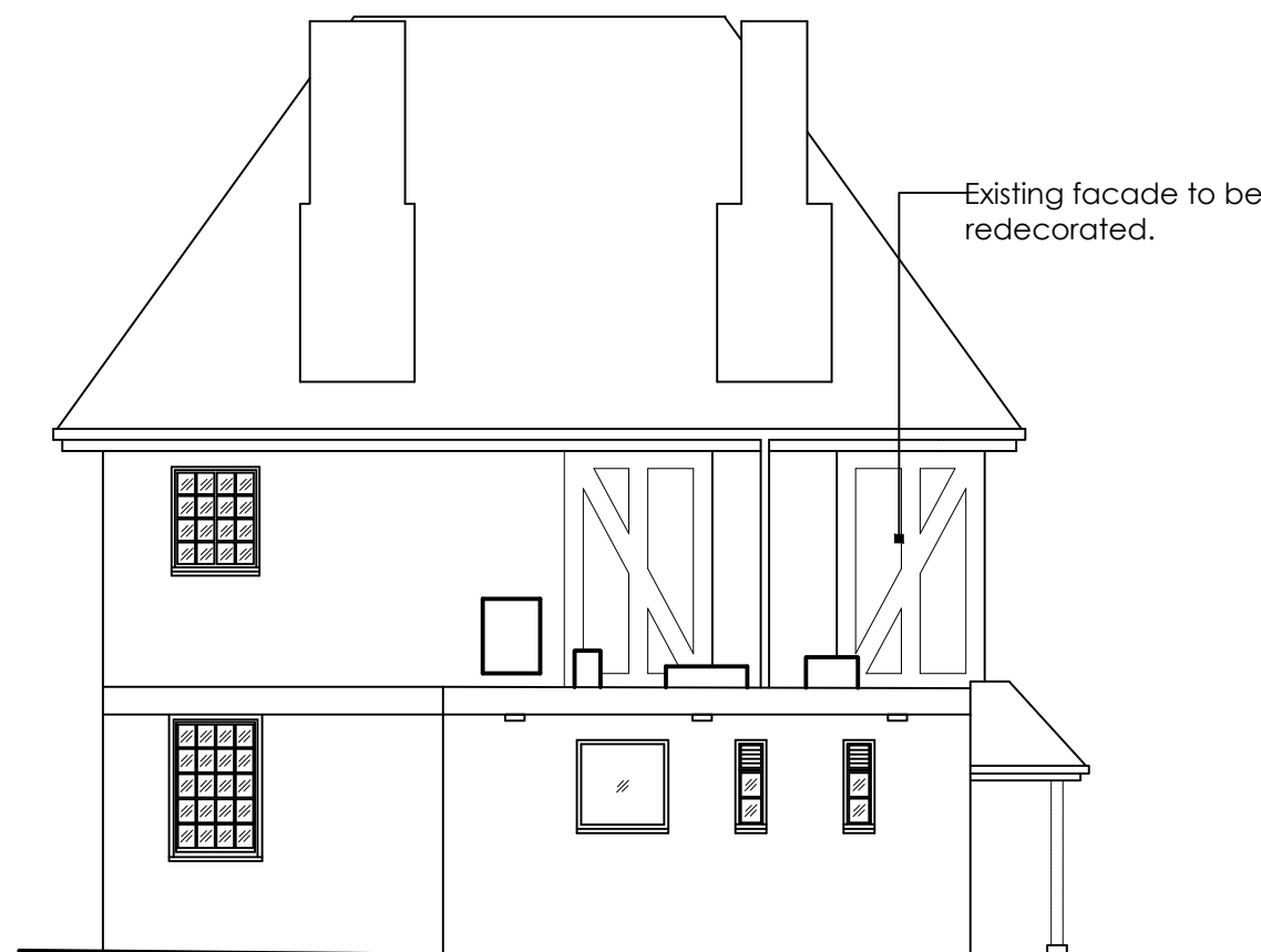
ELEVATION B Scale 1:100