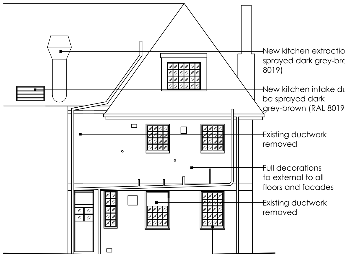
ELEVATION C Scale 1:100