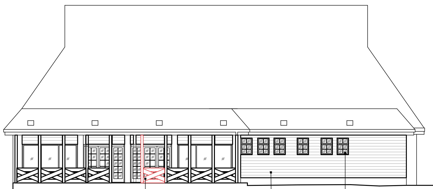
ELEVATION E Scale 1:100