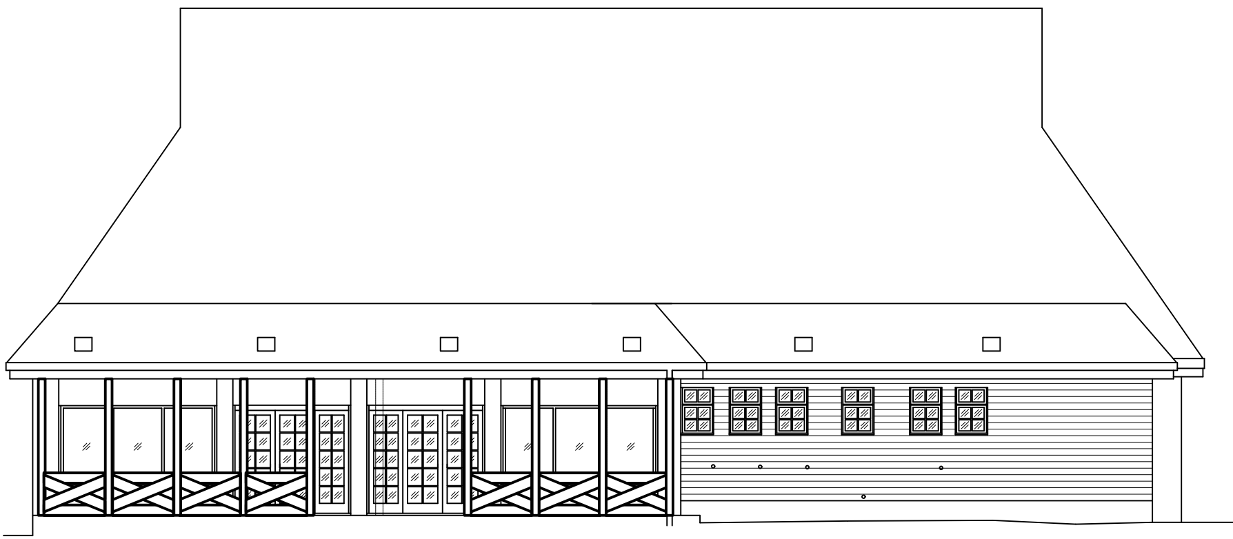
ELEVATION E Scale 1:100