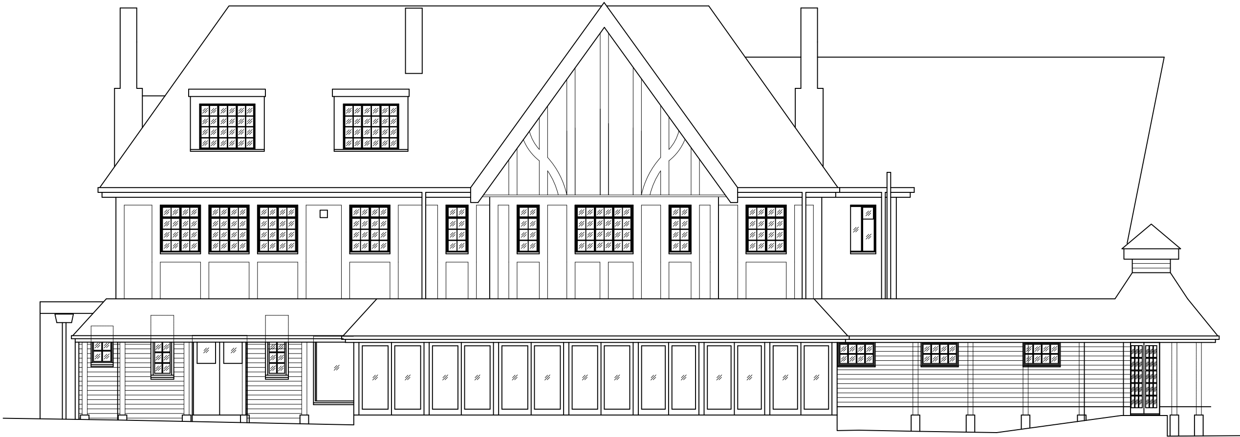
ELEVATION A Scale 1:100