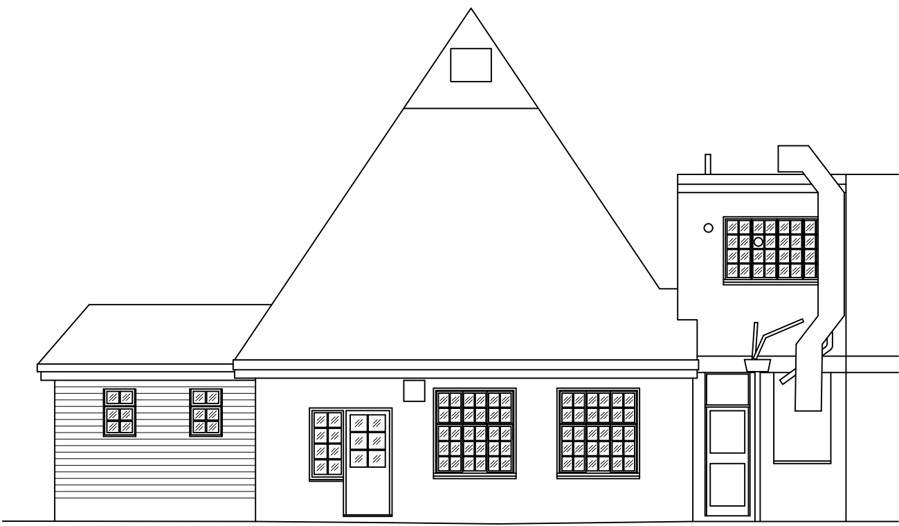
ELEVATION D Scale 1:100