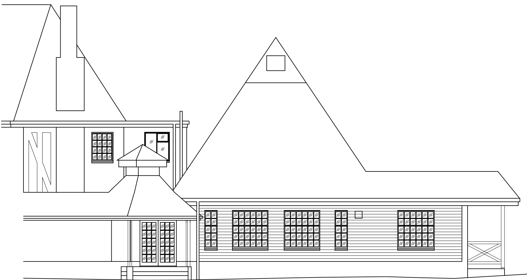
ELEVATION F Scale 1:100