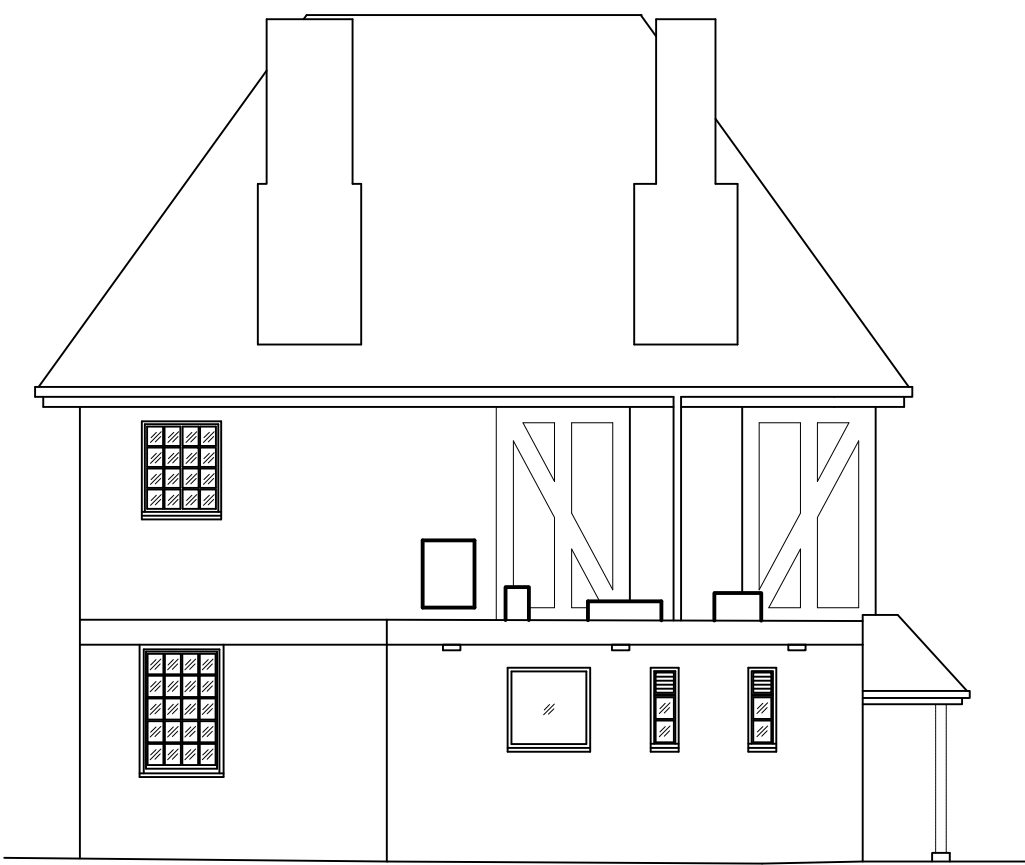
ELEVATION B Scale 1:100