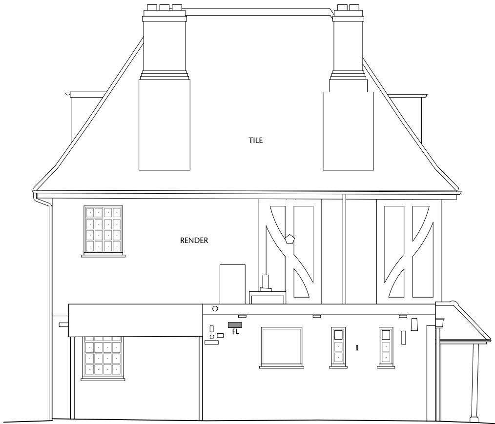
06 PROPOSED EXTERNAL ELEVATION SIDE OF KITCHEN 1:50@A1/ 1:100 @ A3