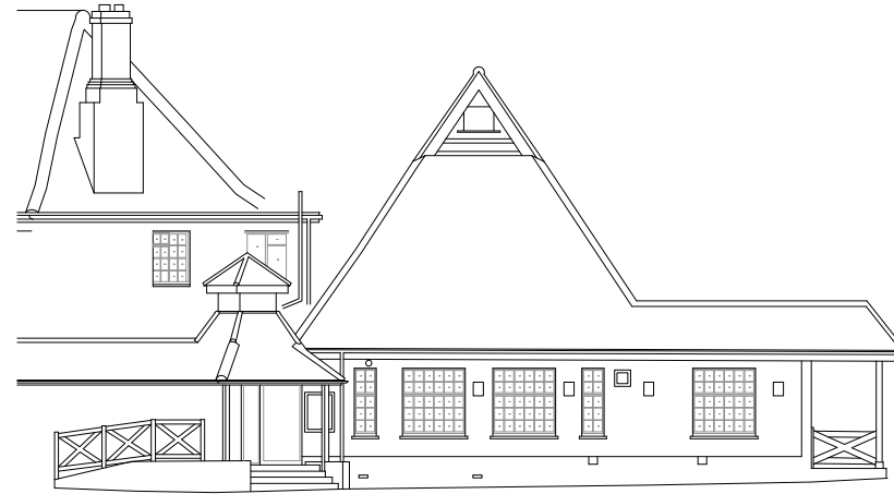
02 EXISTING ELEVATION 2 1:100 @ A1