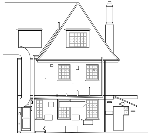
05 EXISTING ELEVATION 5 1:100 @ A1