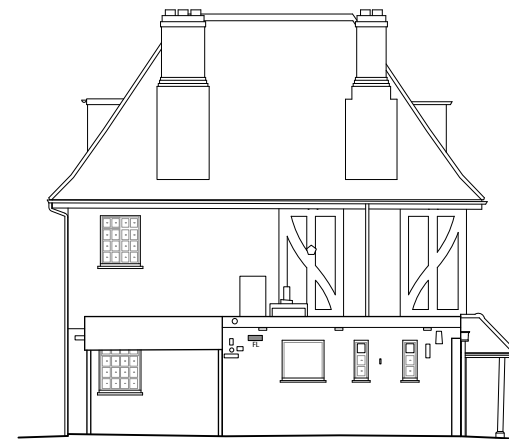
06 EXISTING ELEVATION 6 1:100 @ A1