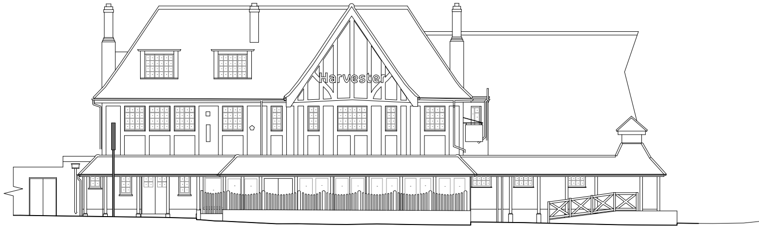
01 EXISTING ELEVATION 1 1:100 @ A1