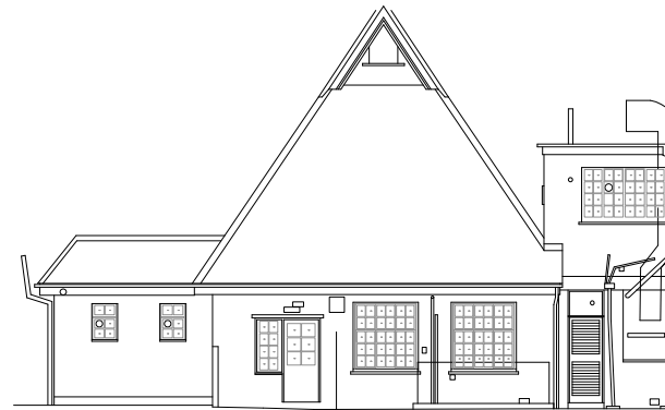
04 EXISTING ELEVATION 4 1:100 @ A1