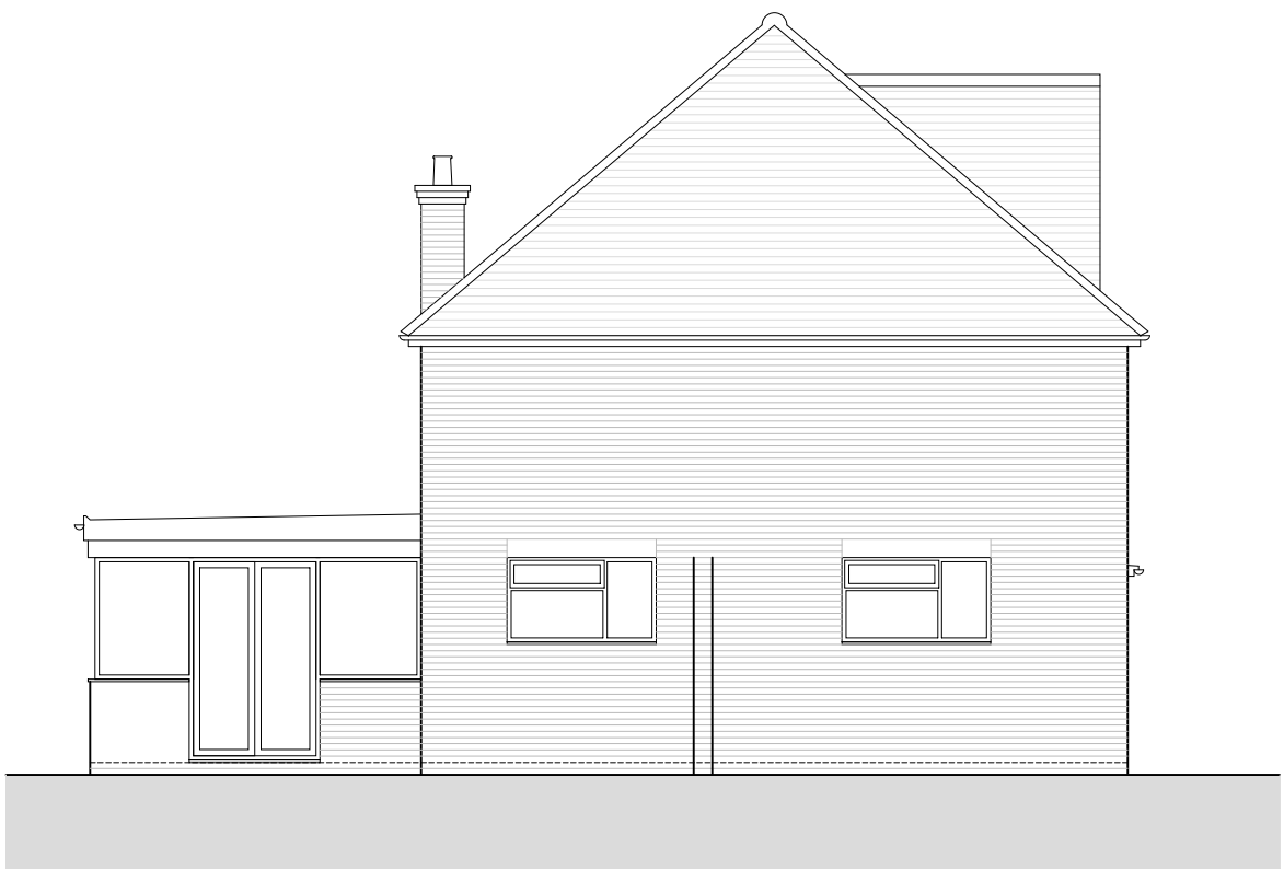
EXISTING EAST ELEVATION SCALE 1 : 100