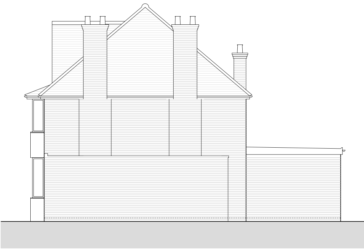
EXISTING WEST ELEVATION SCALE 1 : 100