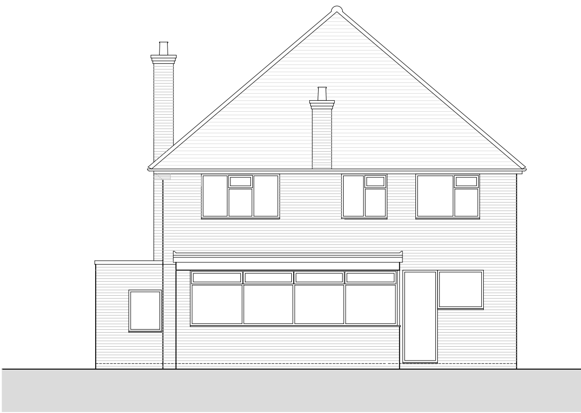
EXISTING NORTH ELEVATION SCALE 1 : 100