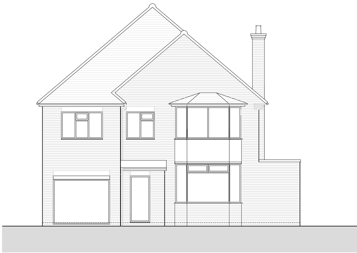
EXISTING SOUTH ELEVATION SCALE 1 : 100

© SK Design consultants - THIS DRAWING AND DESIGN REMAINS THE COPYRIGHT AND INTELLECTUAL PROPERTY OF SK CONSULTANTS AND SHALL NOT BE COPIED IN ANY FORMAT WITHOUT APPROVAL. THIS DRAWING IS TO BE READ IN CONJUNCTION WITH ALL OTHER DRAWINGS AND DOCUMENTS PROVIDED. THE CONTRACTOR MUST CHECK ALL DIMENSIONS ON SITE BEFORE PLACING ORDERS FOR MATERIALS OR SHOP FABRICATIONS OR COMMENCING WORKS ON SITE. ANY DISCREPANCIES SHOULD BE NOTIFIED BEFORE PROCEEDING.