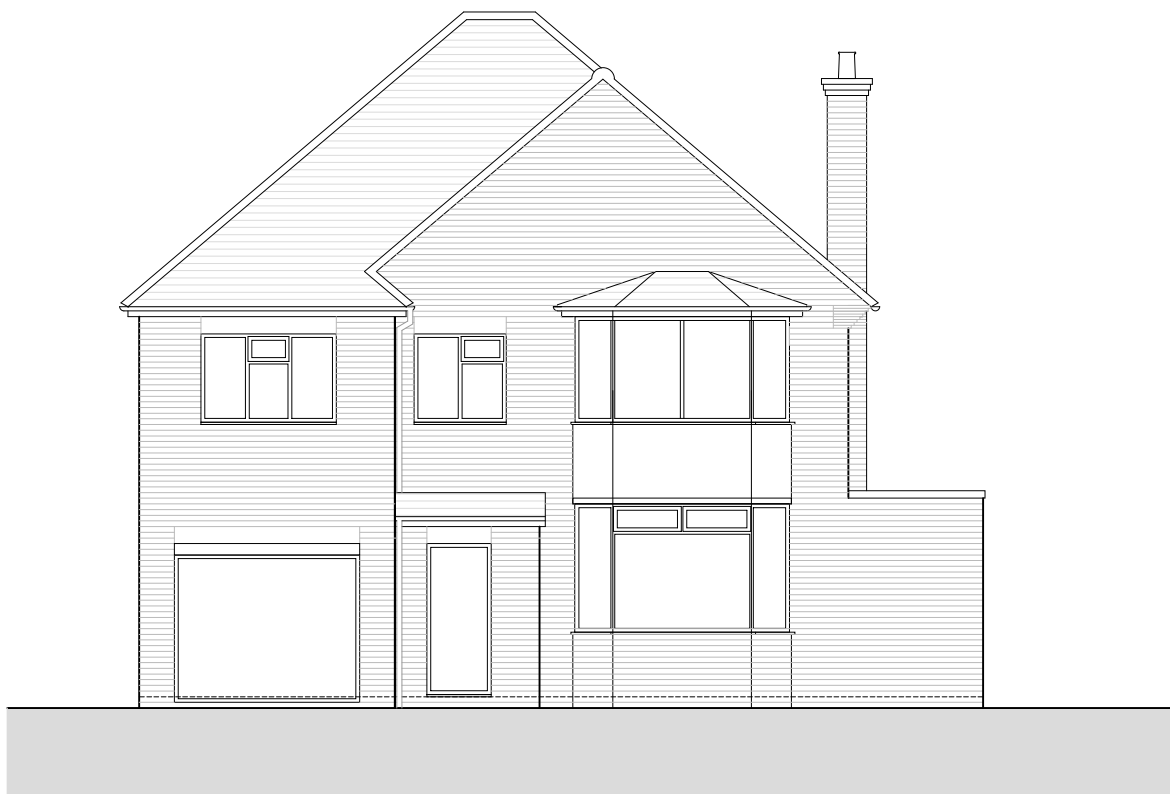
EXISTING SOUTH ELEVATION SCALE 1 : 100

© SK Design consultants - THIS DRAWING AND DESIGN REMAINS THE COPYRIGHT AND INTELLECTUAL PROPERTY OF SK CONSULTANTS AND SHALL NOT BE COPIED IN ANY FORMAT WITHOUT APPROVAL. THIS DRAWING IS TO BE READ IN CONJUNCTION WITH ALL OTHER DRAWINGS AND DOCUMENTS PROVIDED. THE CONTRACTOR MUST CHECK ALL DIMENSIONS ON SITE BEFORE PLACING ORDERS FOR MATERIALS OR SHOP FABRICATIONS OR COMMENCING WORKS ON SITE. ANY DISCREPANCIES SHOULD BE NOTIFIED BEFORE PROCEEDING.