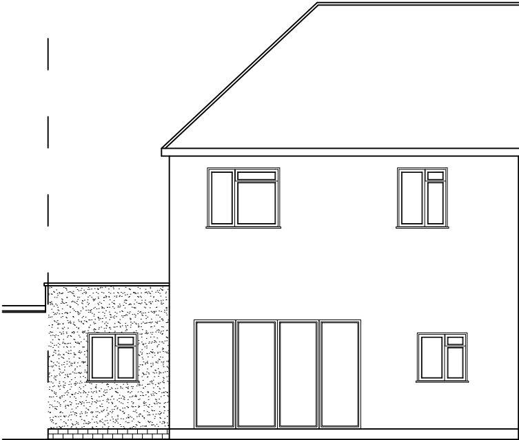
2 Proposed Rear Elevation