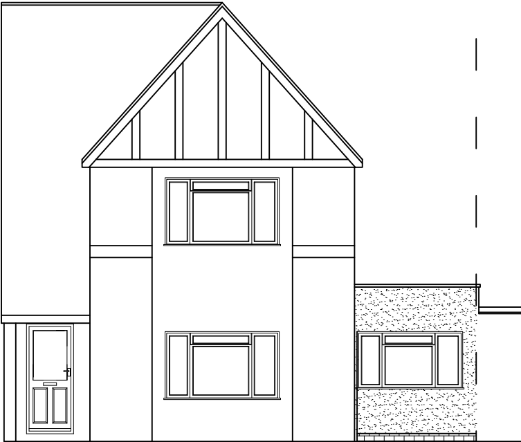
1 Proposed Front Elevation