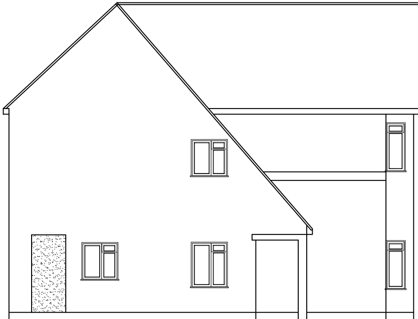
4 Proposed Side Elevation