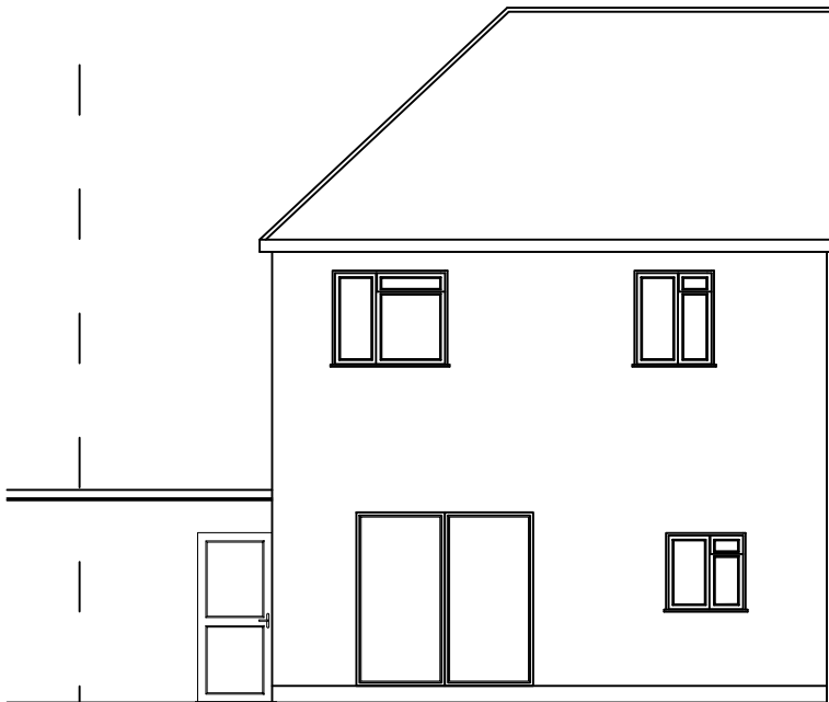
2 Existing Rear Elevation SCALE: 1:100