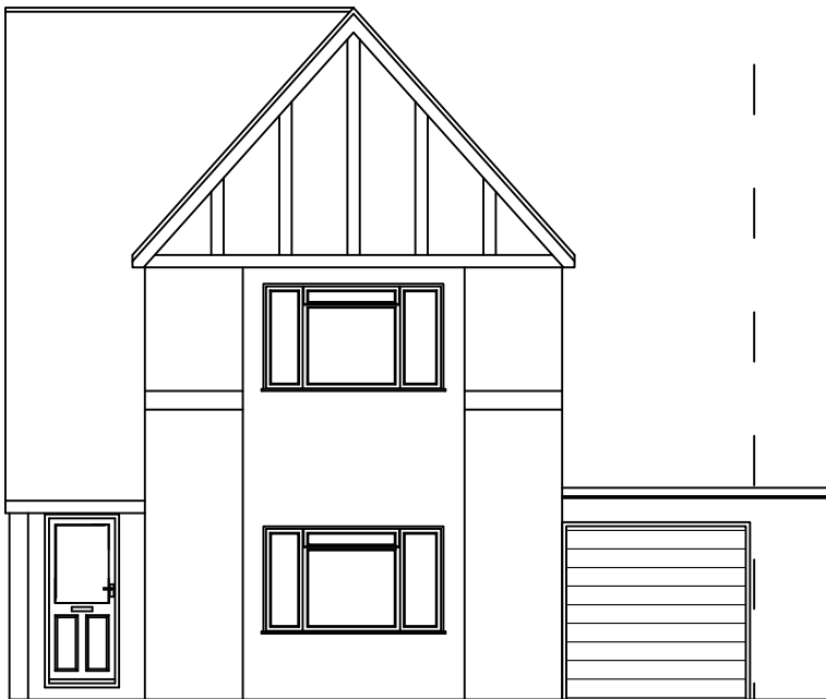
1 Existing Front Elevation SCALE: 1:100