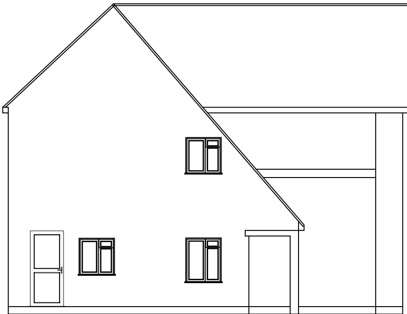
4 Existing Side Elevation SCALE: 1:100