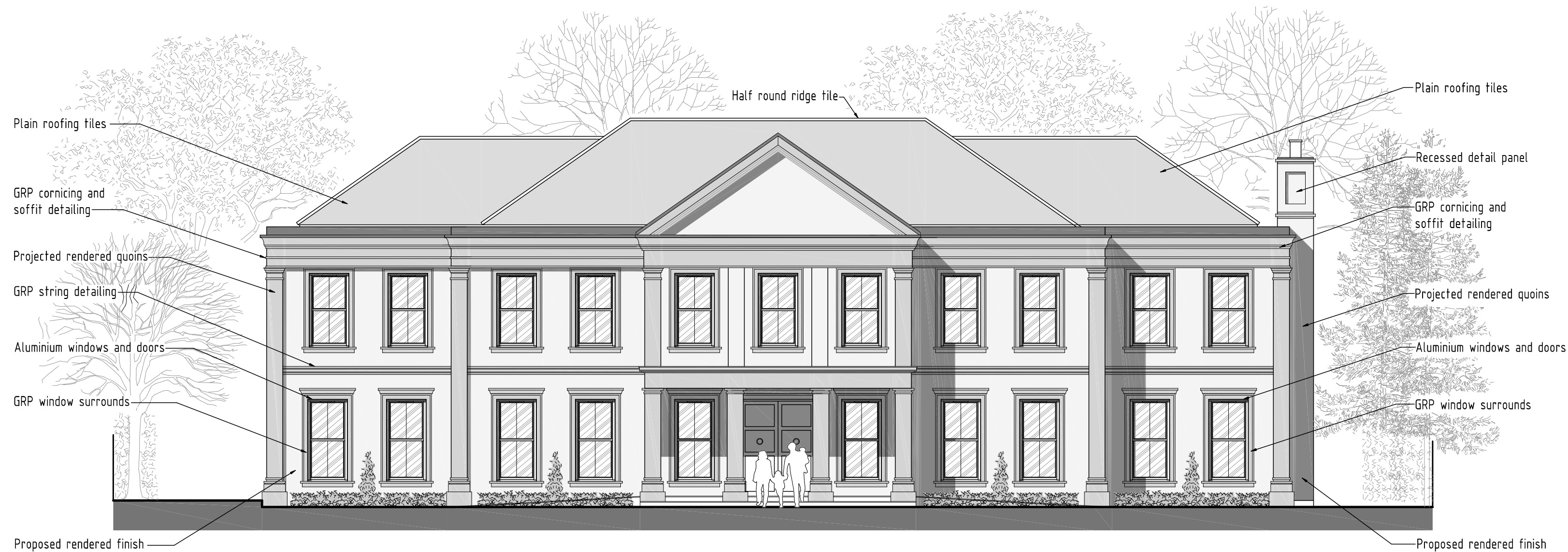
P R O P O S E D F R O N T E L E V A T I O N