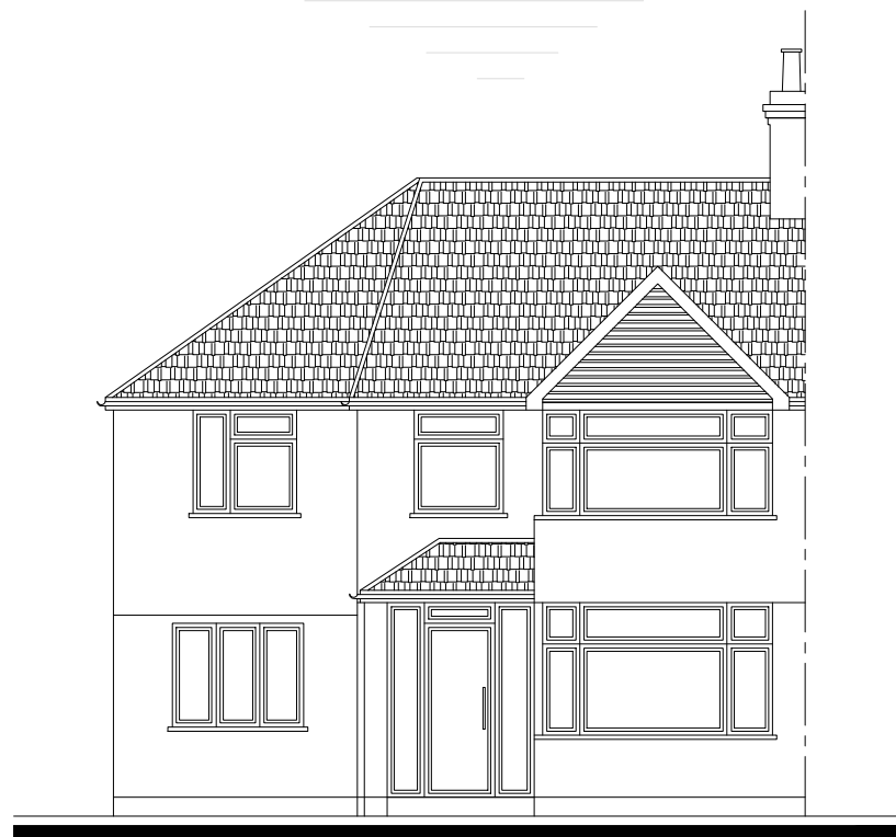
Proposed Front Elevation (Remains Unaltered) Scale 1:100

This drawing is not to be scaled. Use figured dimensions only. All errors and omissions are to be reported to the Technical Department.