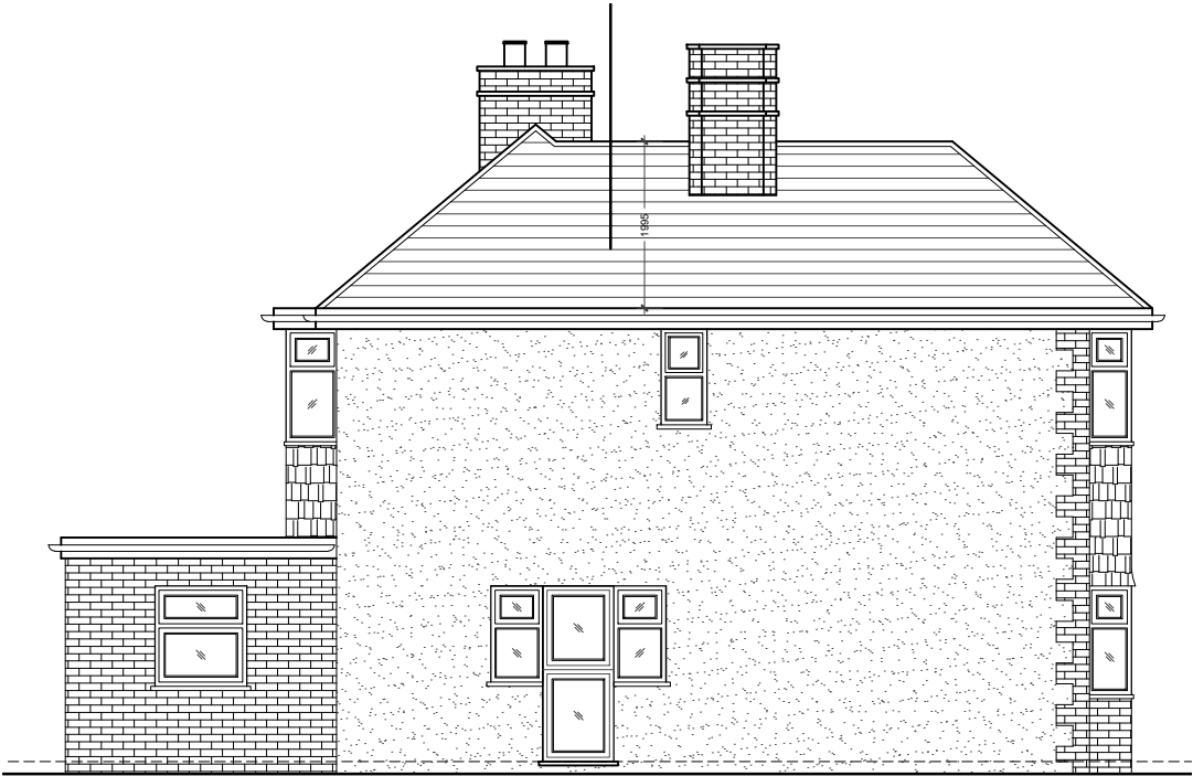
03 - SIDE ELEVATION