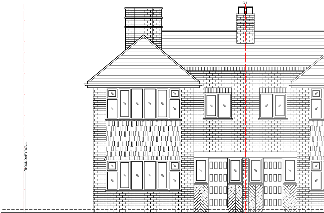
04 - FRONT ELEVATION