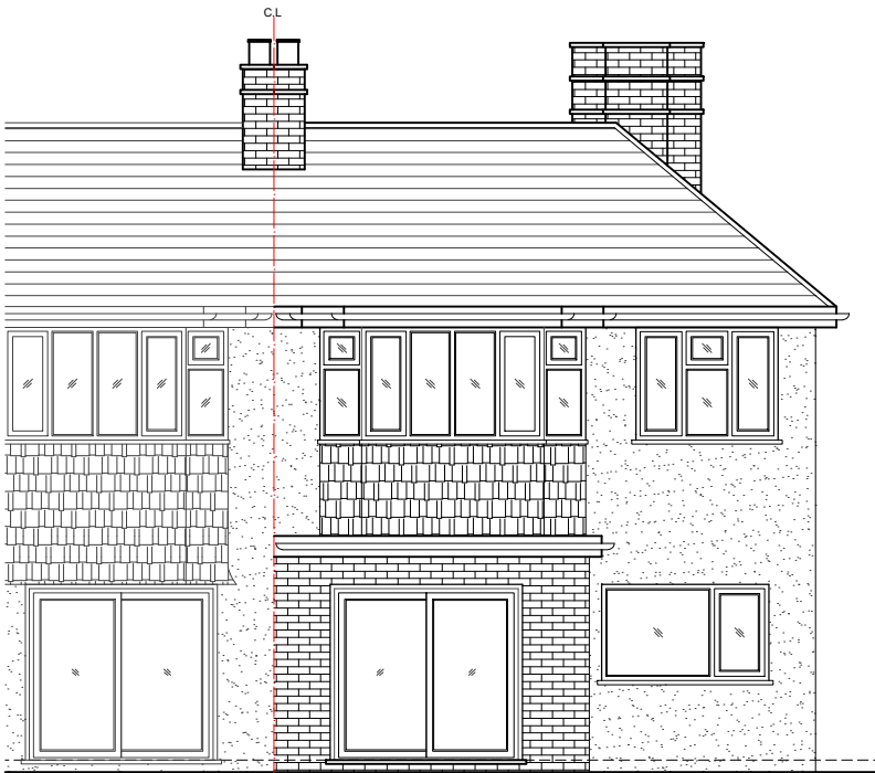
05 - REAR ELEVATION