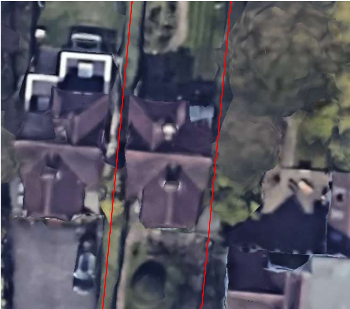
AERIAL VIEW Site shown in red