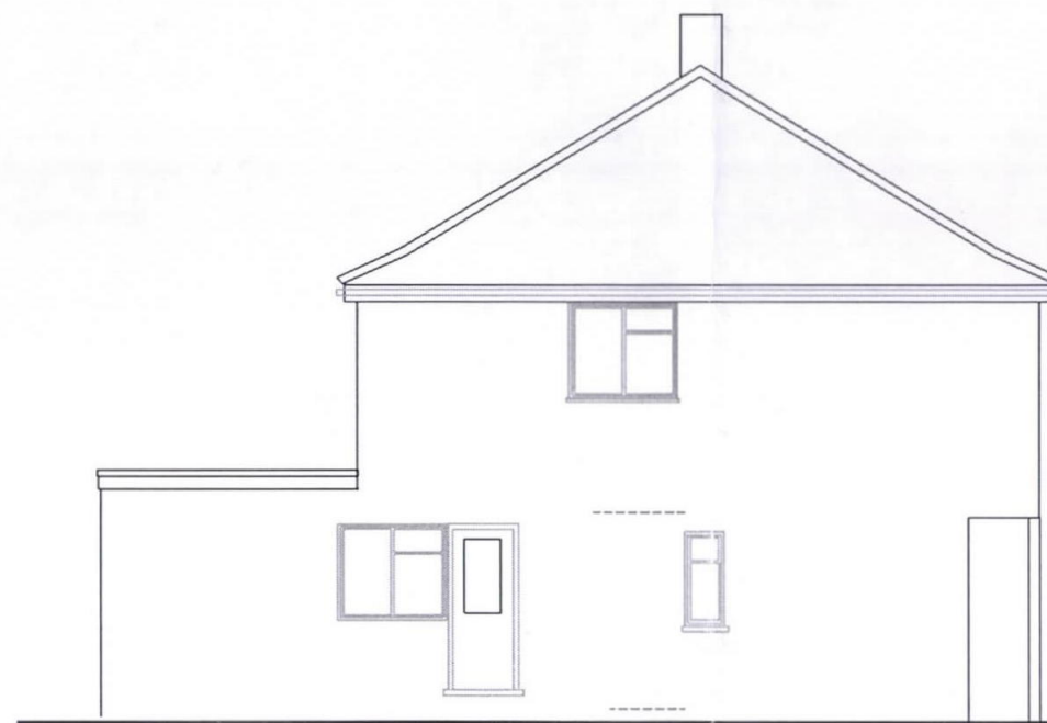
Side elevation 1:100