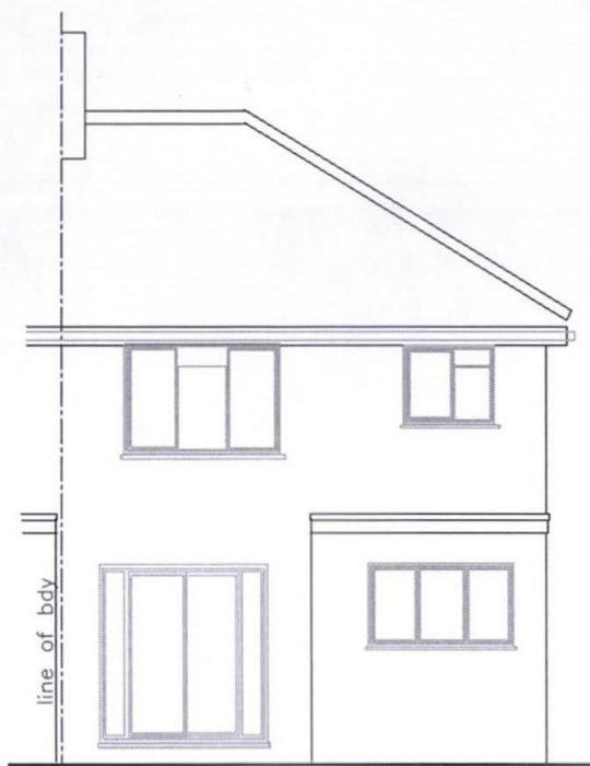
Rear Elevation 1:100