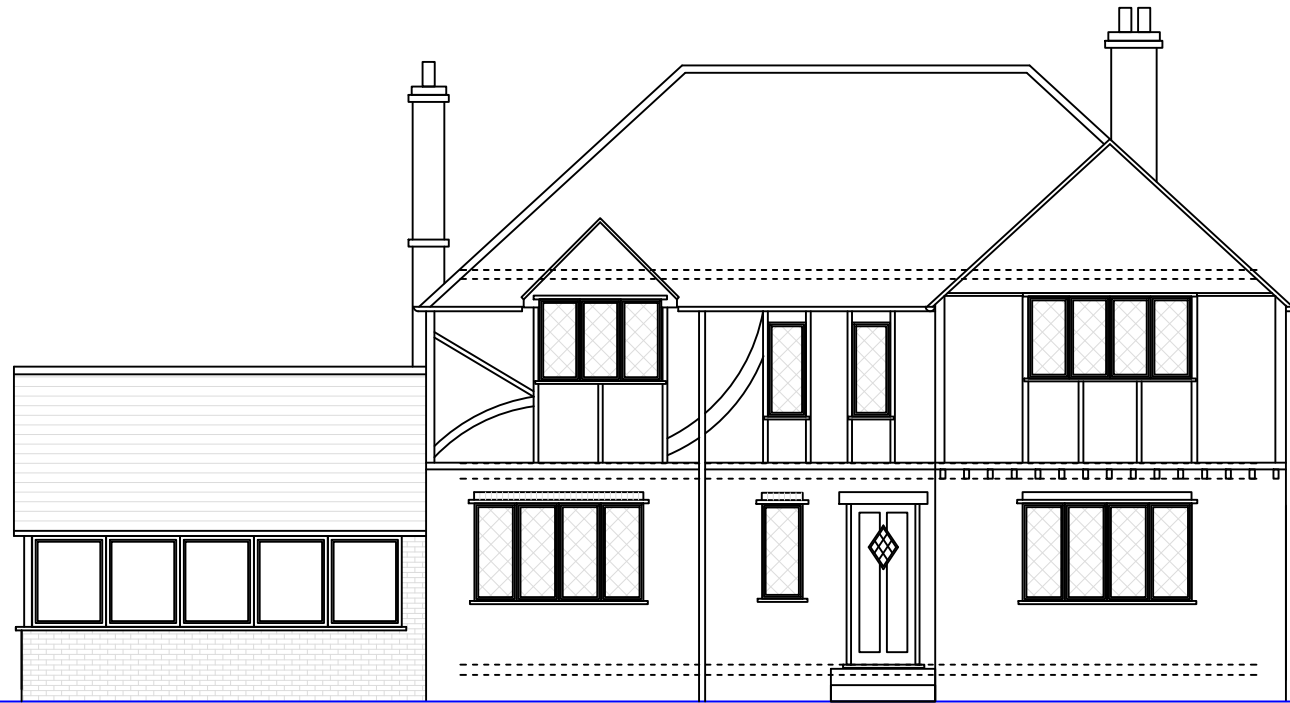
○ Front Elevation 1:100