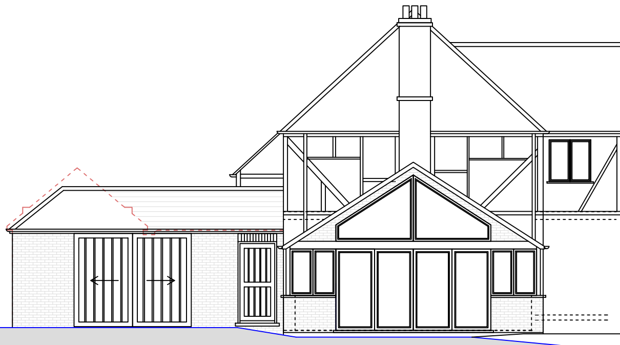
○ Side Elevation 2 1:100