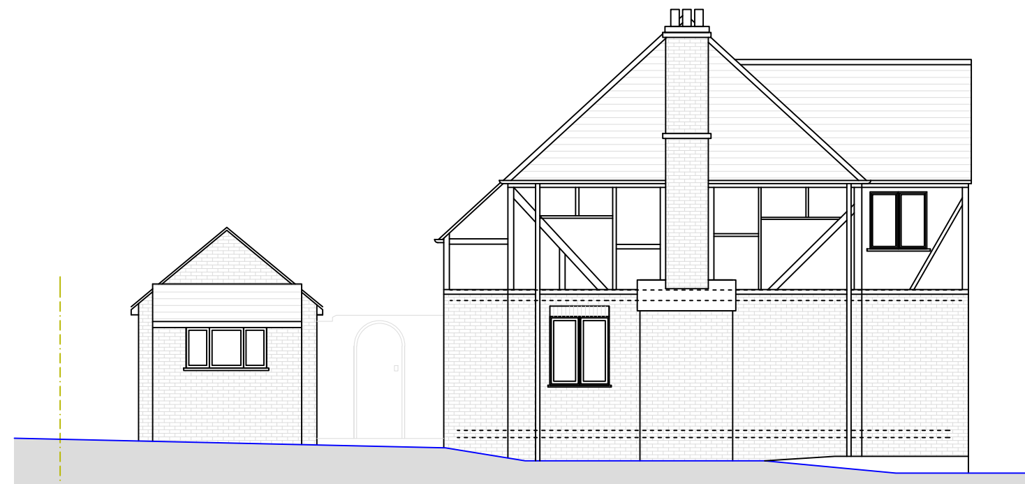
○ Side Elevation 2 1:100