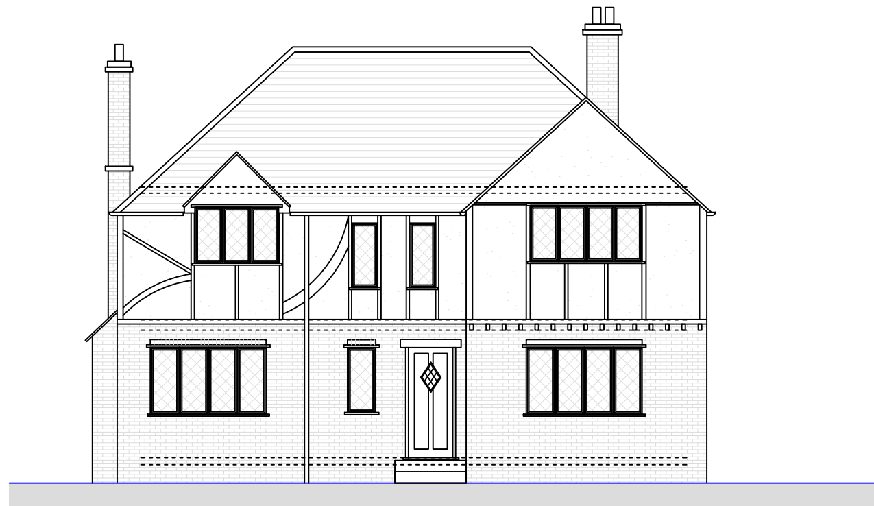
○ Front Elevation 1:100