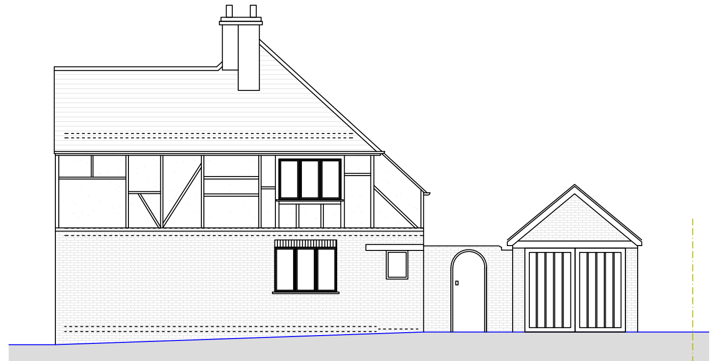
○ Side Elevation 1 1:100