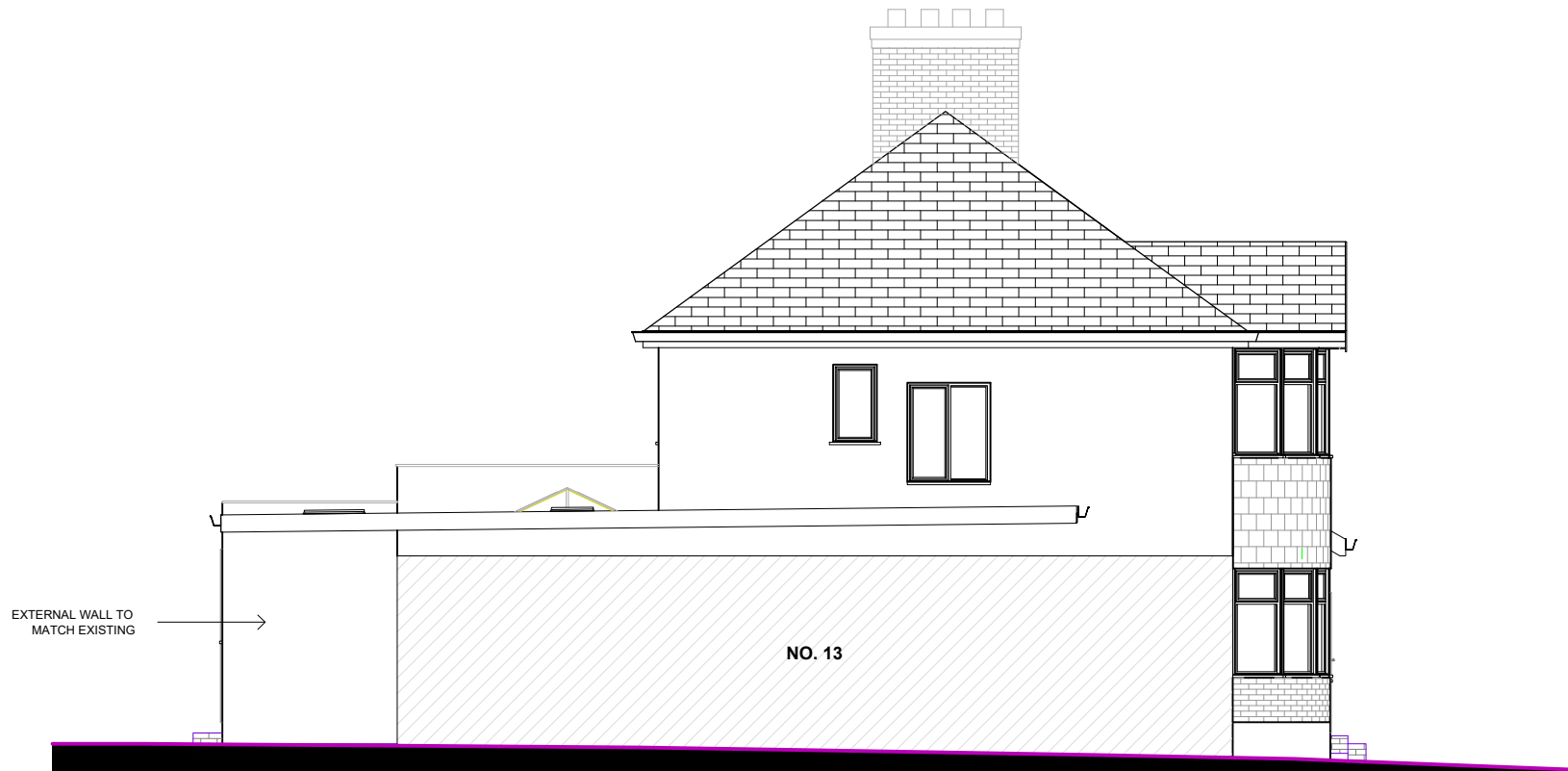
Proposed Left Side Elevation 1 : 100