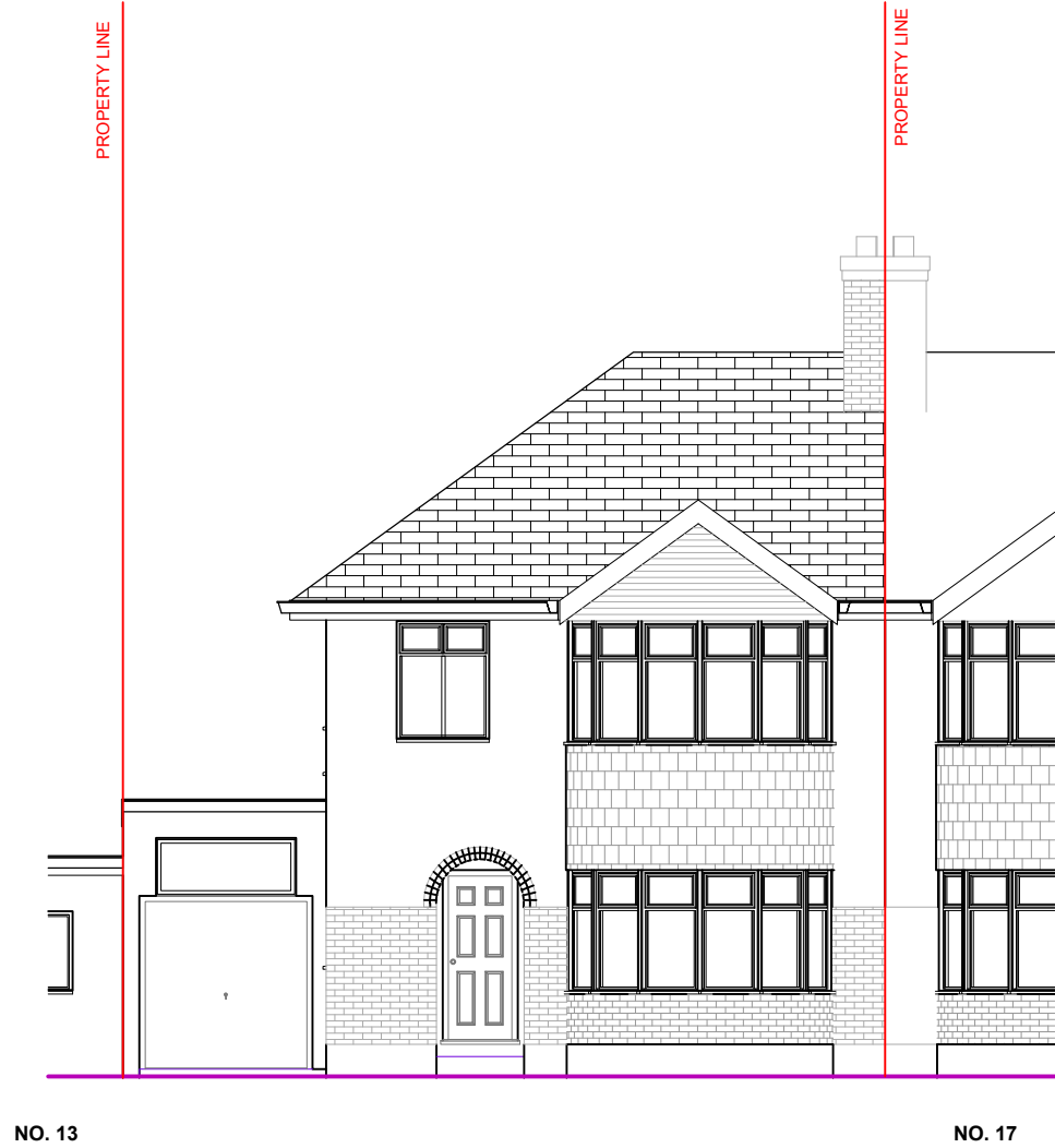
Proposed Front Elevation 1 : 100