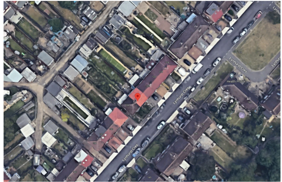
1. AERIAL VIEW