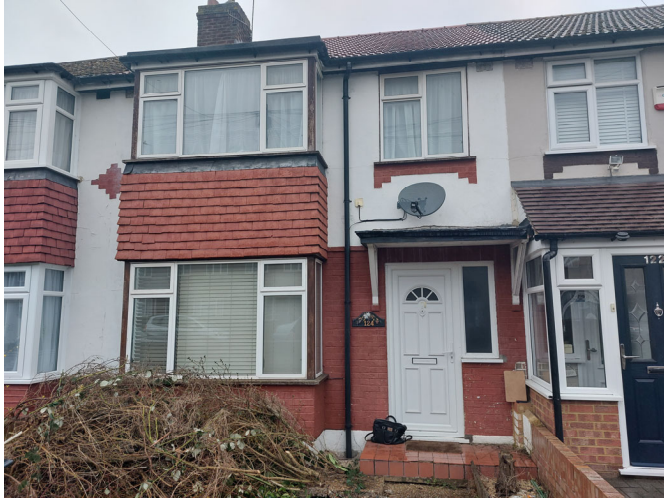
2. FRONT VIEW