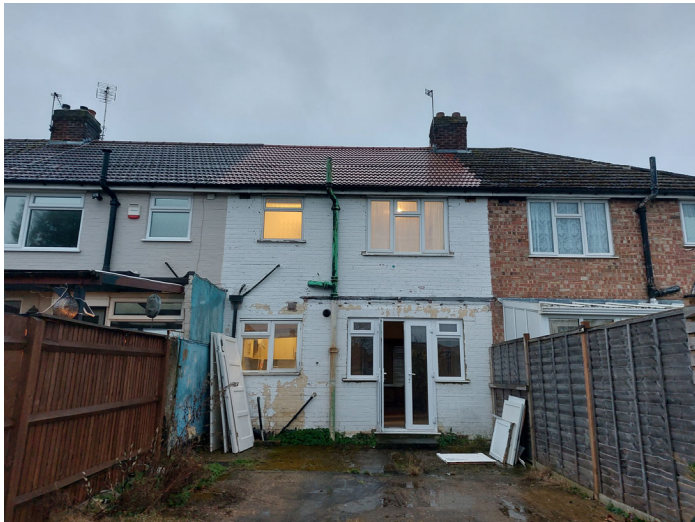
3. REAR VIEW