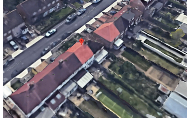
4. 3D GOOGLE VIEW