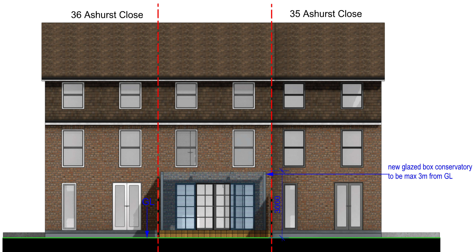
02 02 REAR ELEV Scale: 1:100

ROOF - Flat roof- to be fully glazed conservatory roof