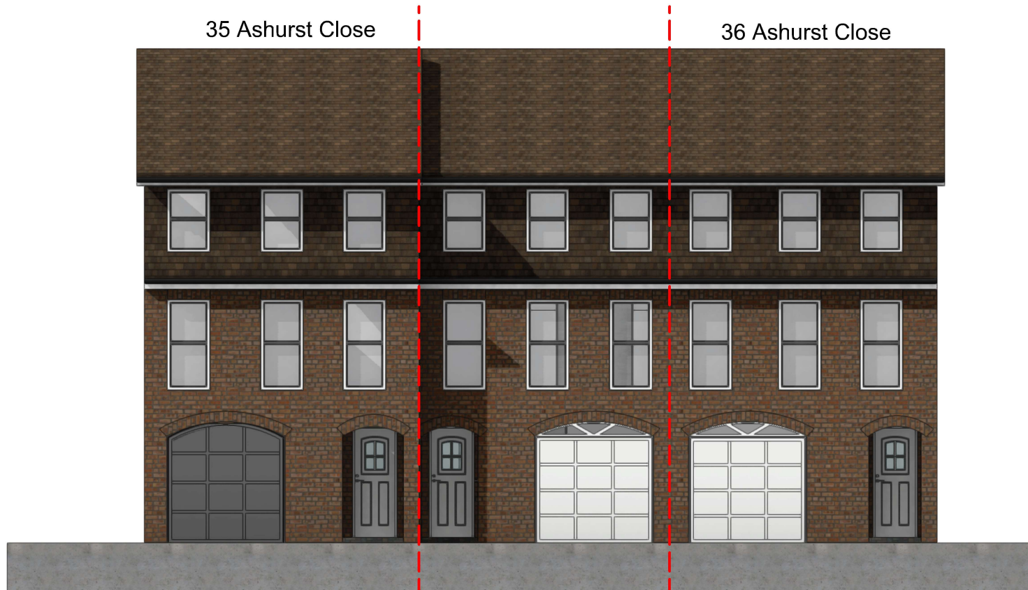
01 01 FRONT ELEV Scale: 1:100

WALLS - New glazed box conservatory walls to be glass