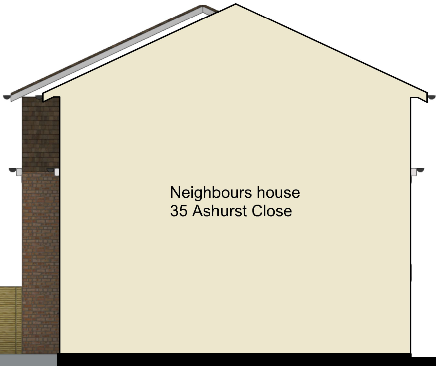
2 02 SIDE ELEV Scale: 1:100