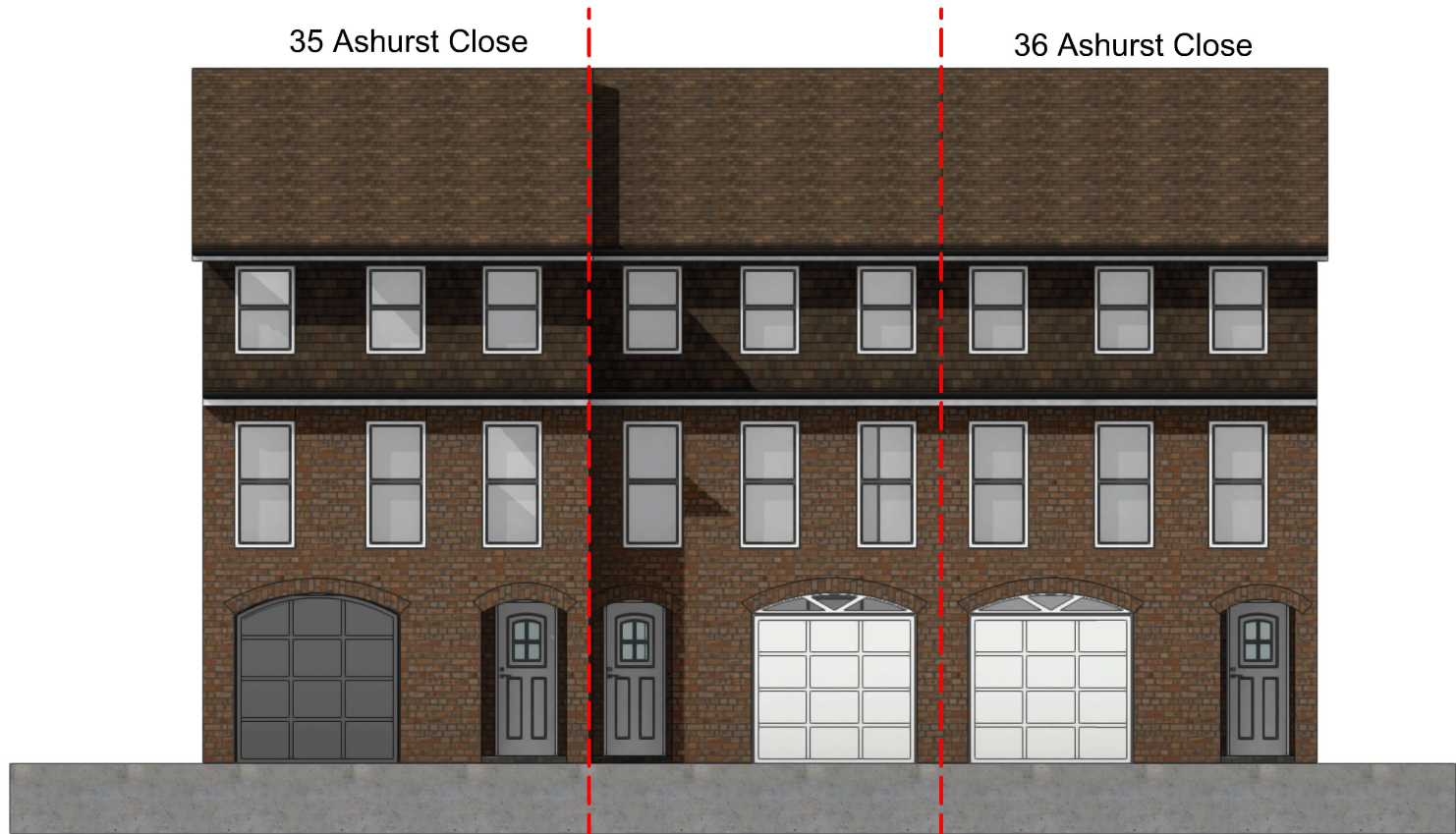
01 01 FRONT ELEV Scale: 1:100