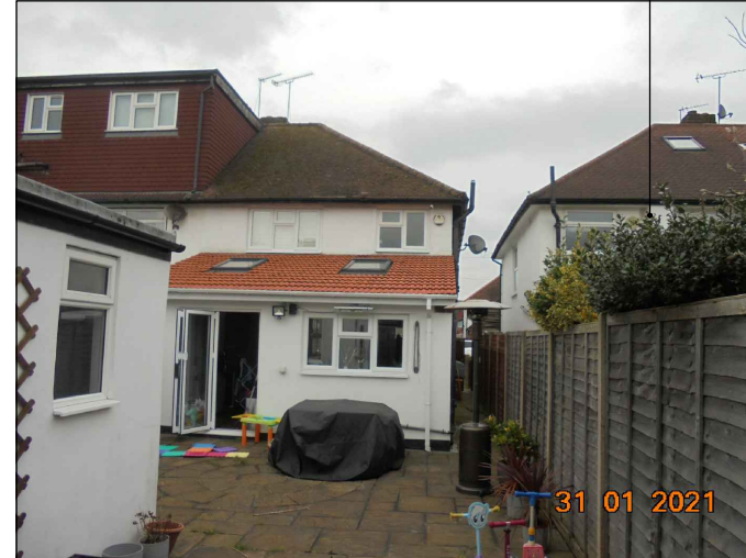
NEIGHBOURING PROPERTY No. 7