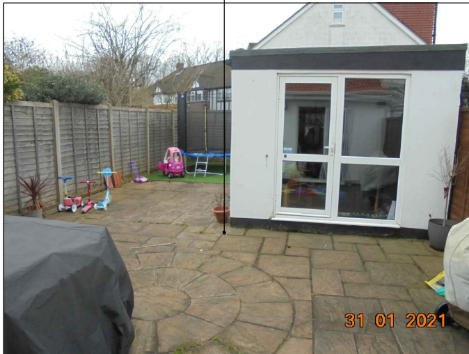
THE BACK GARDEN OF THE DWELLINGHOUSE