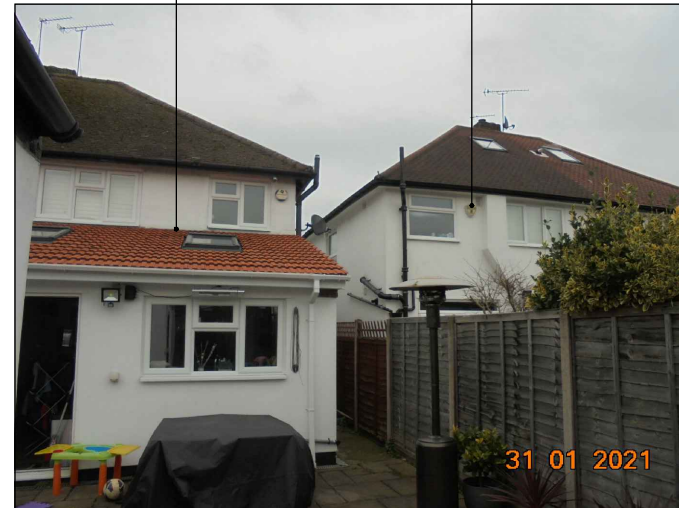
NEIGHBOURING PROPERTY No. 7