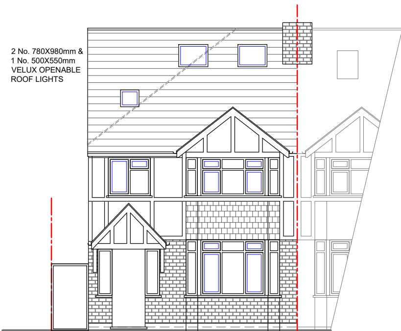
NO.9 PROPOSED FRONT ELEVATION