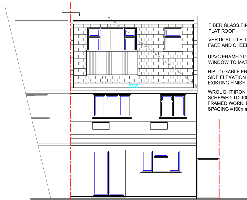
NO.9 PROPOSED REAR ELEVATION