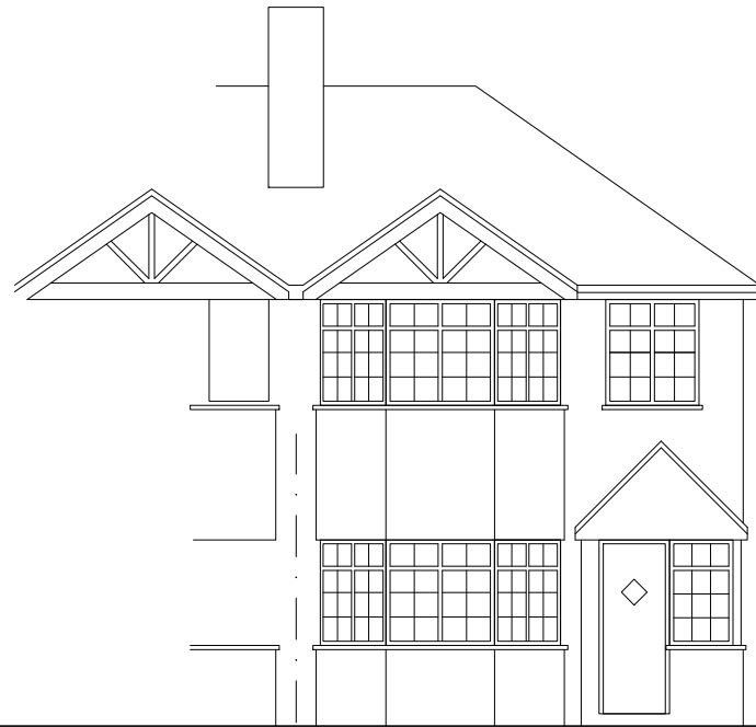
FRONT ELEVATION (WEST)