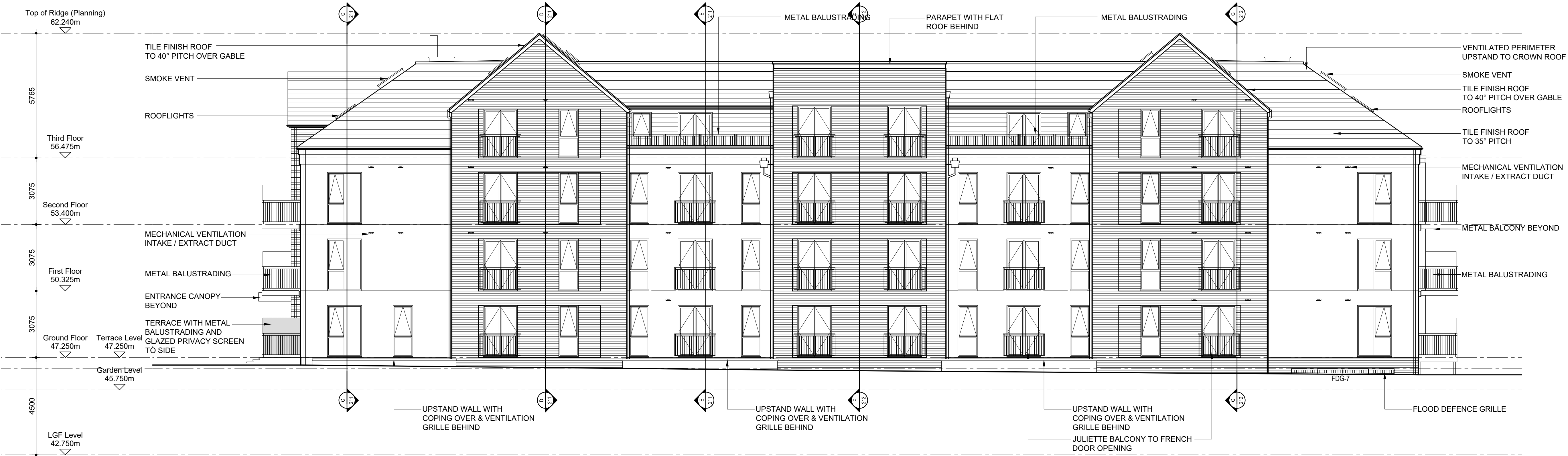
ELEVATION B - WEST