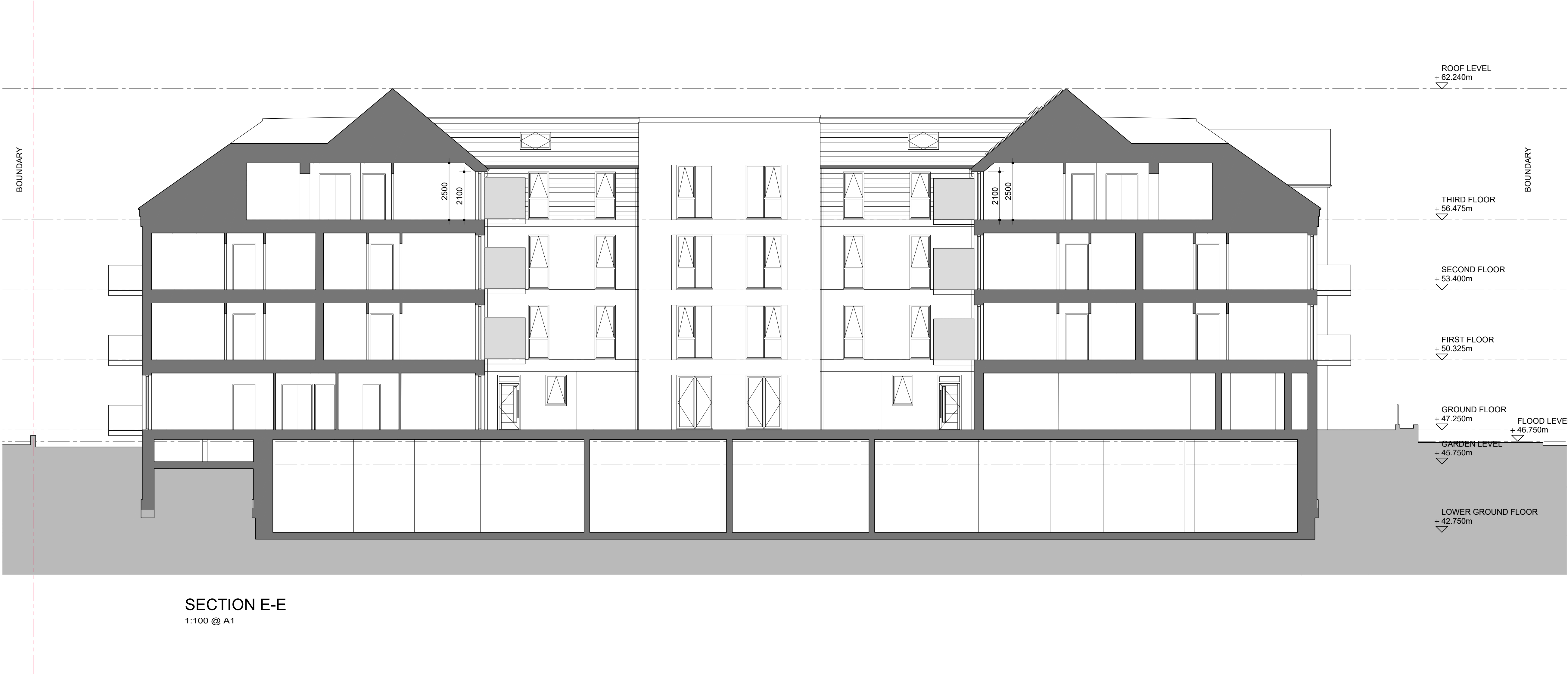
SECTION E-E 1:100 @ A1