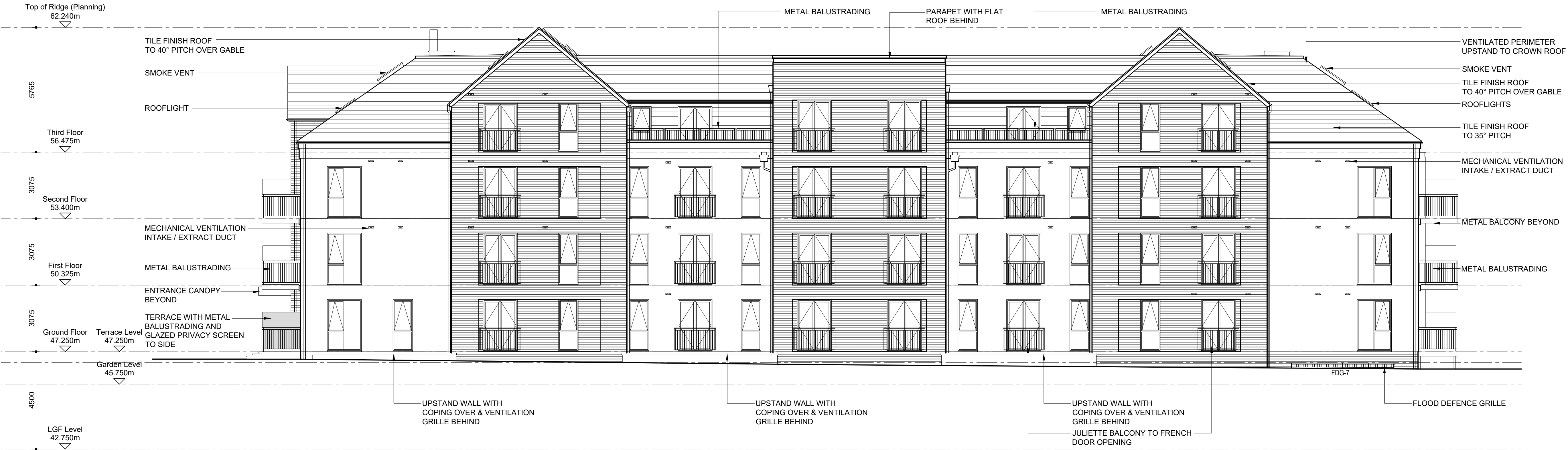
ELEVATION B - WEST