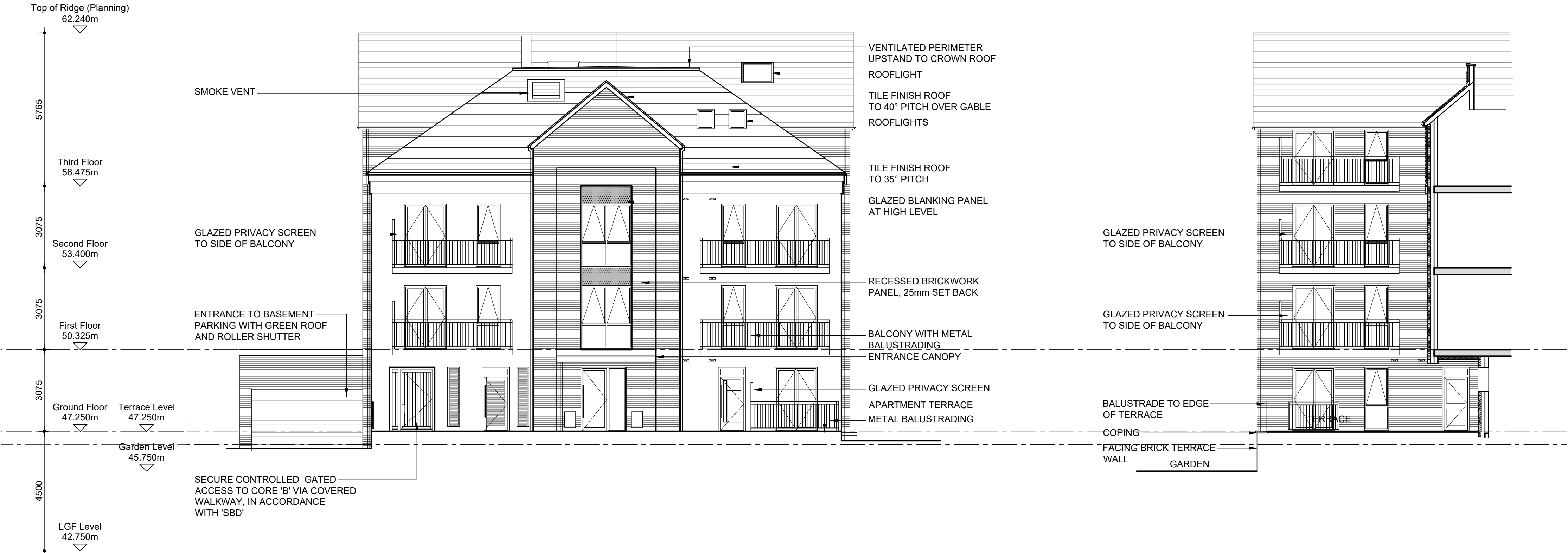
ELEVATION A - NORTH