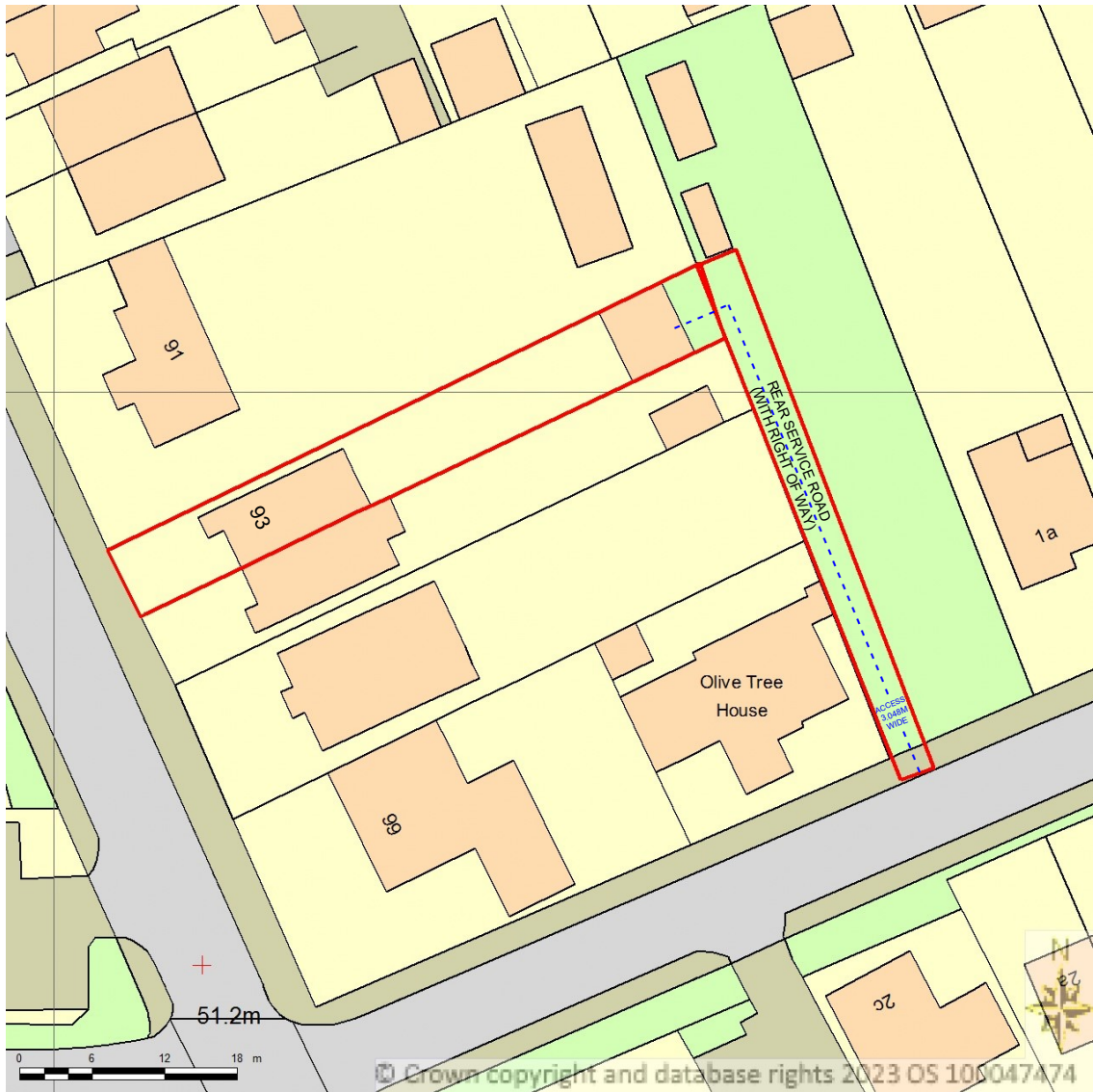
SITE PLAN (1:500)