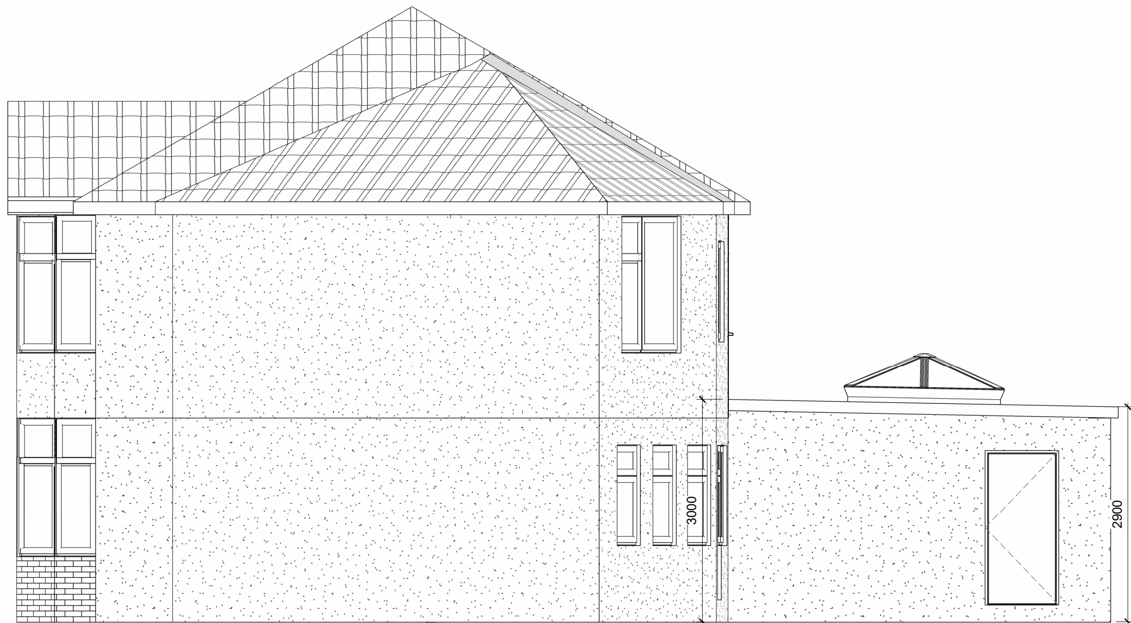
3 Side Elevation of Proposed Dwelling 1 : 50