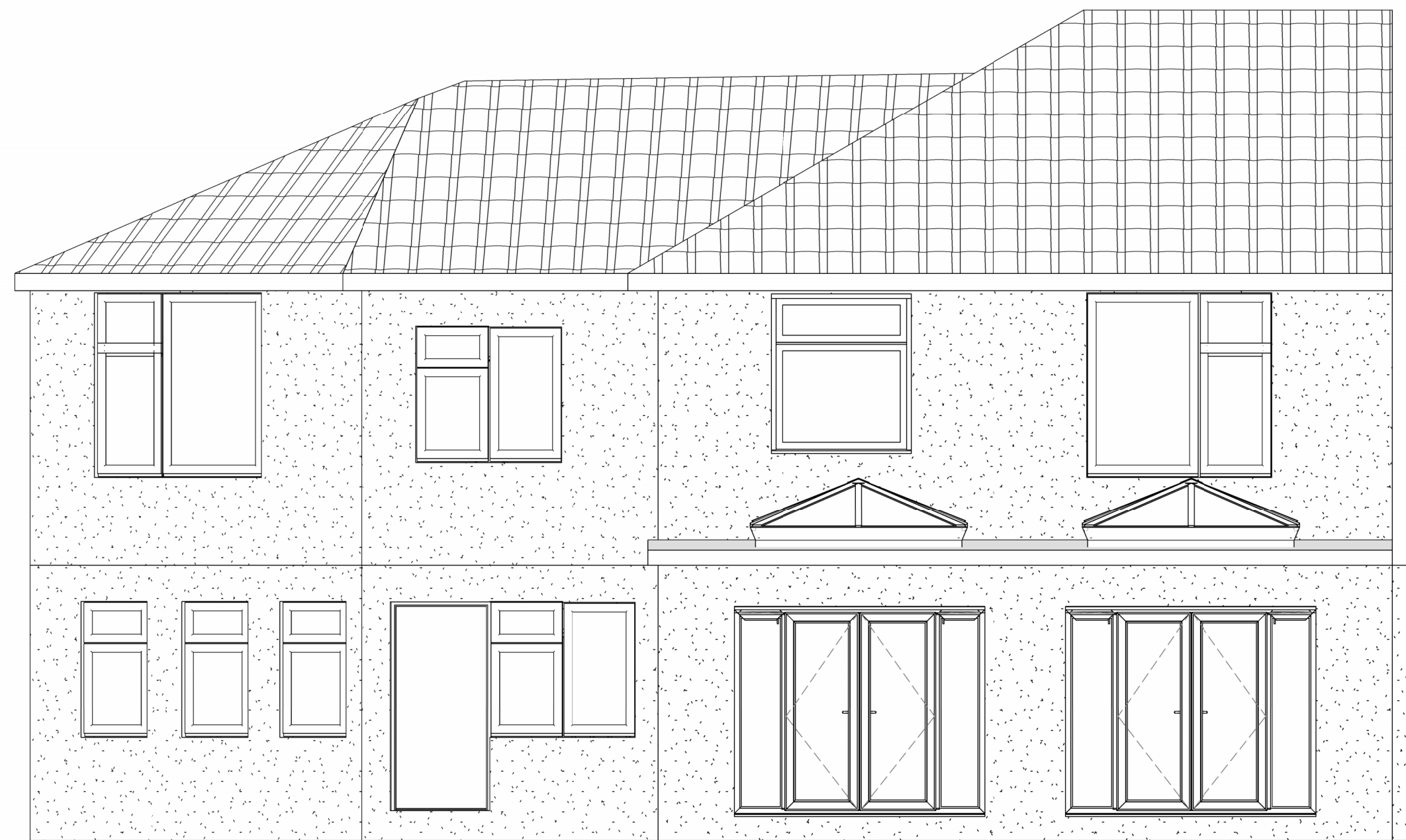
4 Rear Elevation of Proposed Dwelling 1 : 50

NOTES: THE MATERIALS TO BE USED IN THE CONSTRUCTION OF THE EXTERNAL SURFACES OF THE DEVELOPMENT SHALL MATCH THOSE USED ON THE EXISTING DWELLING.