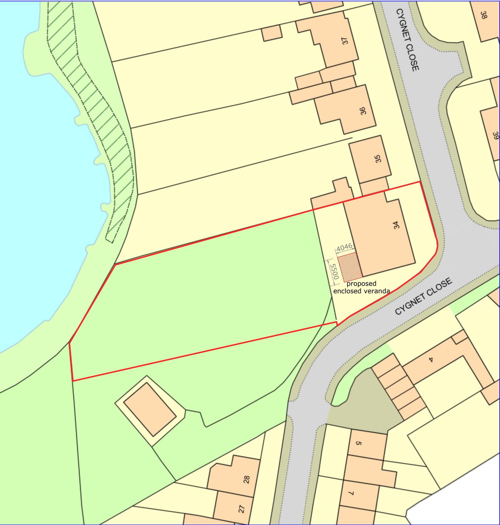
PROPOSED BLOCK PLAN scale 1:500@A3