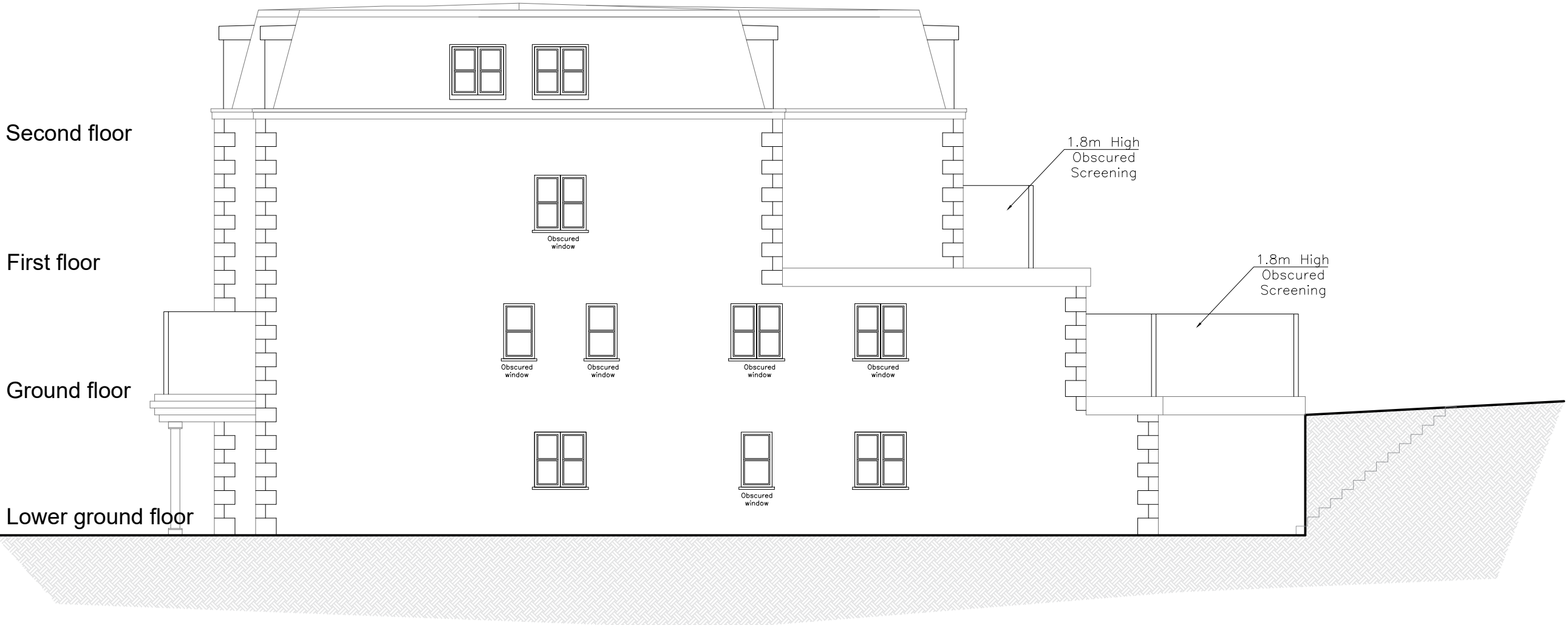
Side Elevation Scale - 1:100