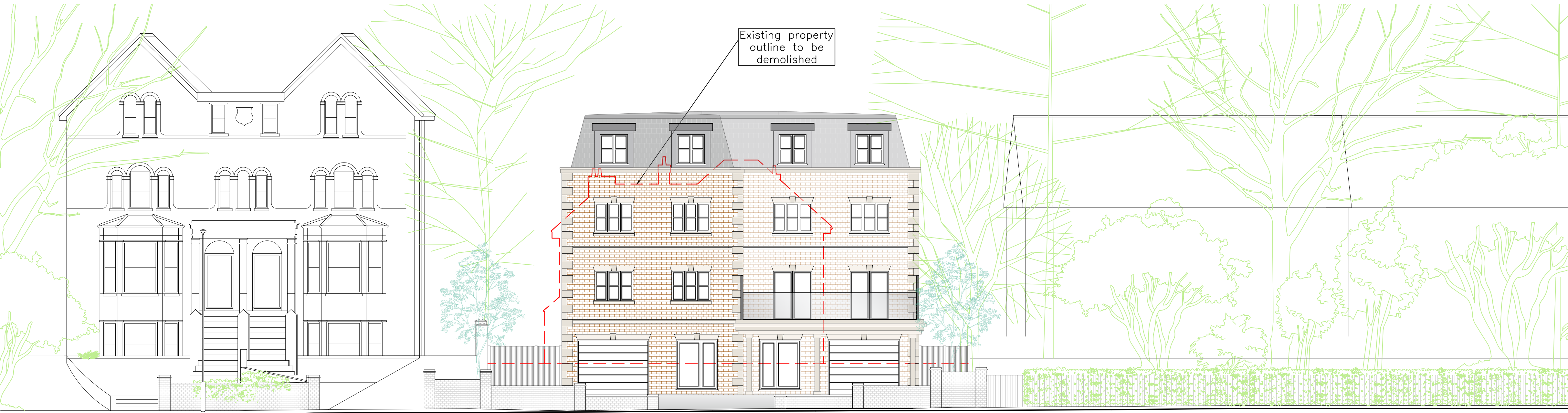
Street Scene Scale - 1:100