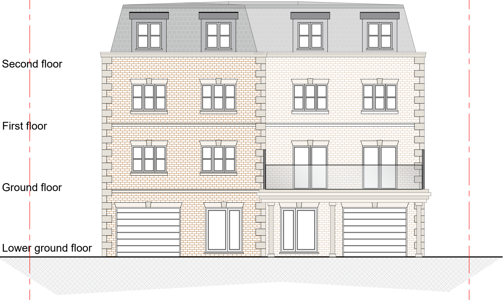
Front Elevation Scale - 1:100

© This drawing is the property of Oxbridge Design and Detailing Services Ltd. Copyright is reserved by them and is issued on the condition that it is not copied or disclosed by or to any unauthorised persons without the prior consent in writing. All Dimensions to be checked on site any discrepancies must be reported to Oxbridge Design and Detailing Services Ltd. prior to undertaking of any relevant works. Written dimensions to be follow in preference to scaled dimensions and all figured dimensions are millimetres unless otherwise stated.