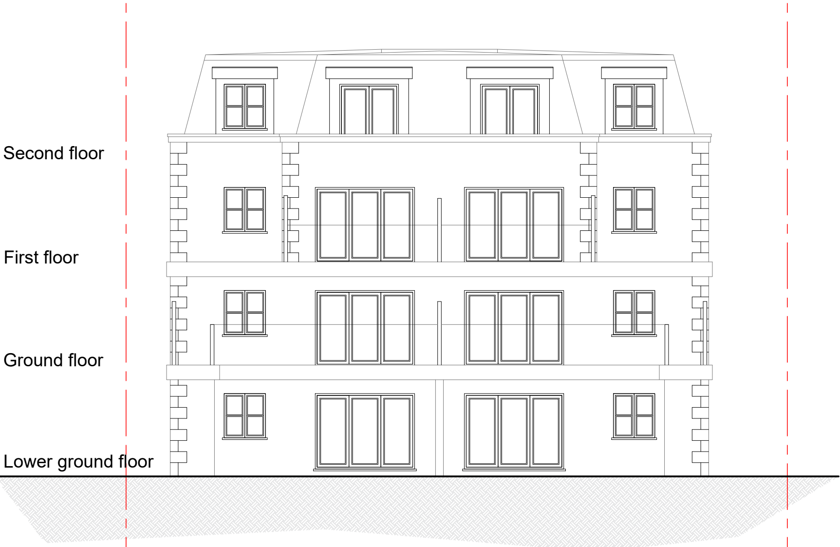
Rear Elevation Scale - 1:100