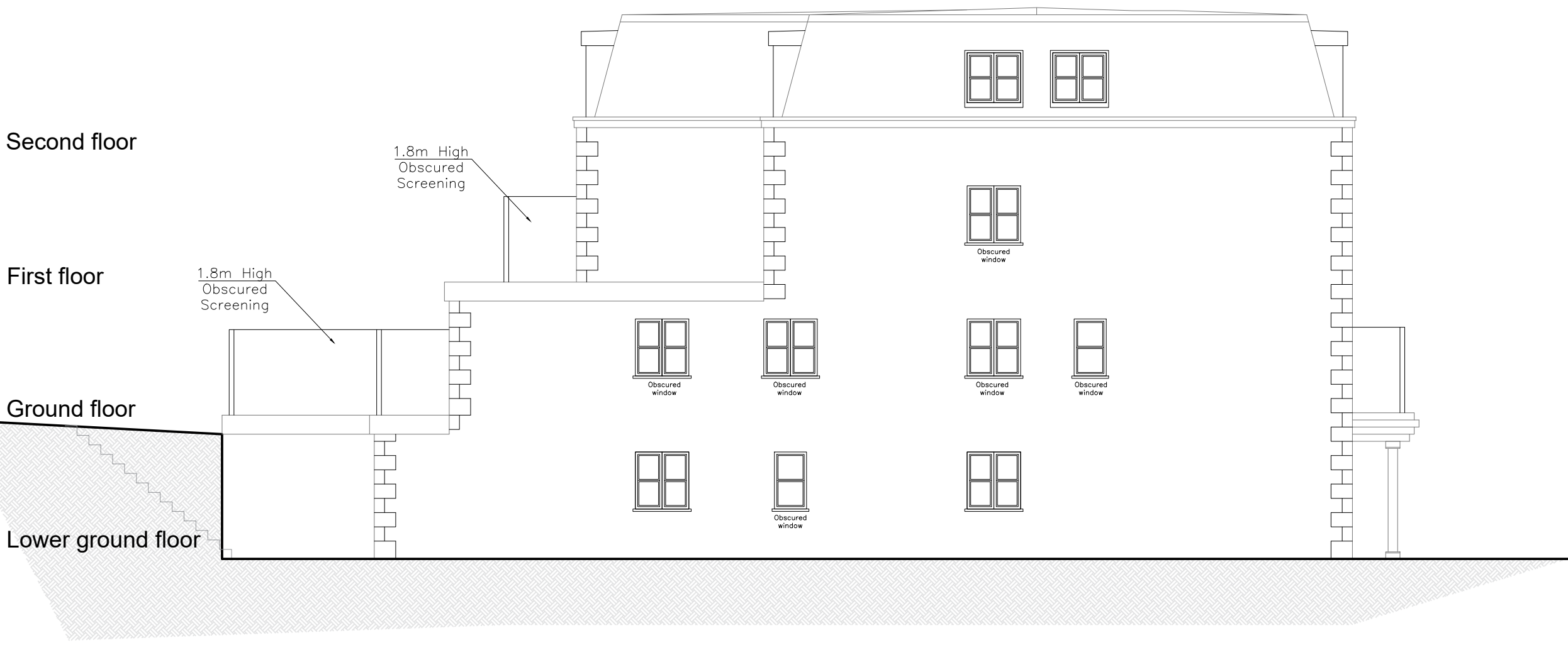
Side Elevation Scale - 1:100