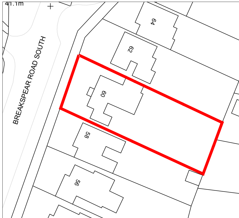
EXISTING BLOCK PLAN - 1:500