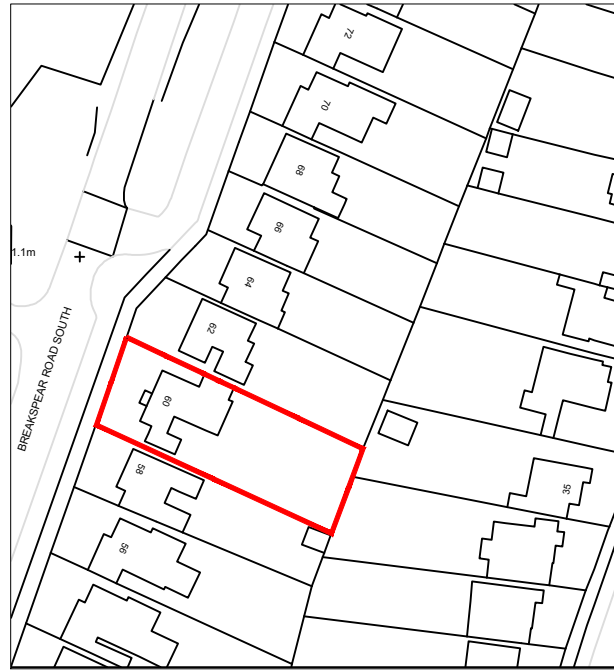
EXISTING LOCATION PLAN - 1:1250