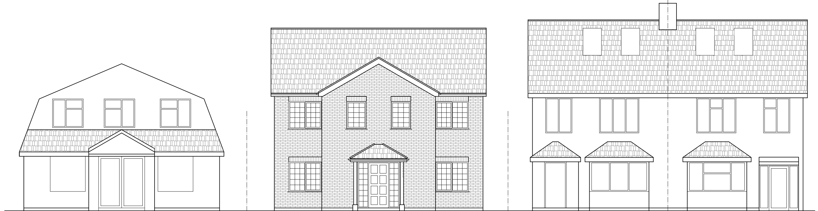
EXISTING/APPROVED STREET ELEVATION