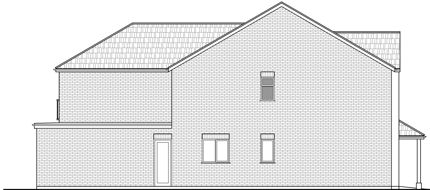
EXISTING/APPROVED SIDE ELEVATION