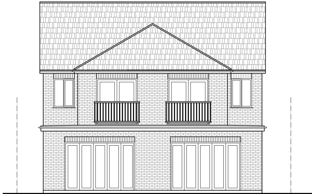
EXISTING/APPROVED REAR ELEVATION