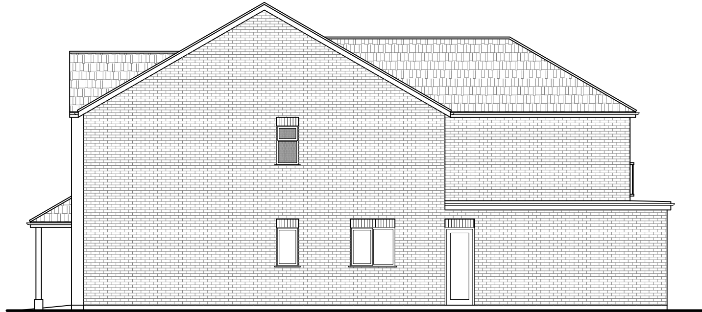
EXISTING/APPROVED SIDE ELEVATION