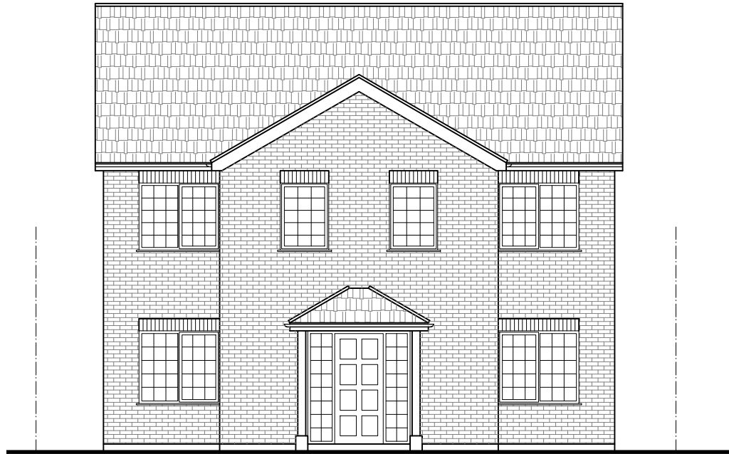
EXISTING/APPROVED FRONT ELEVATION